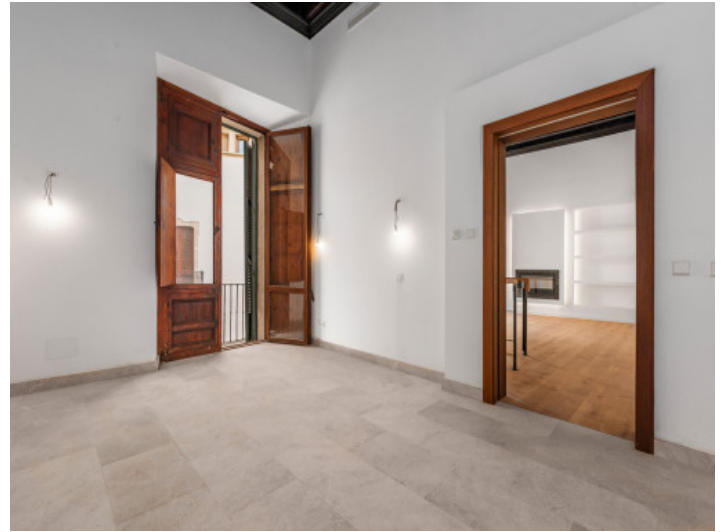
Adjoining dining area and kitchen