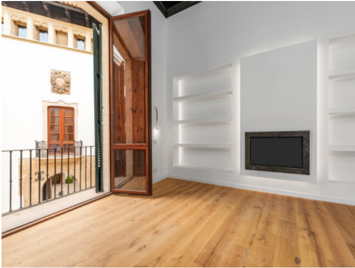
Living area on the upper level