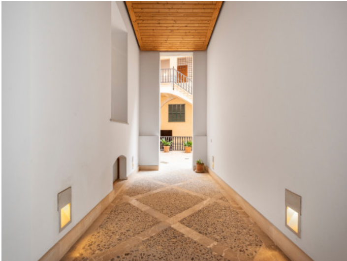
Elegant entrance to the patio