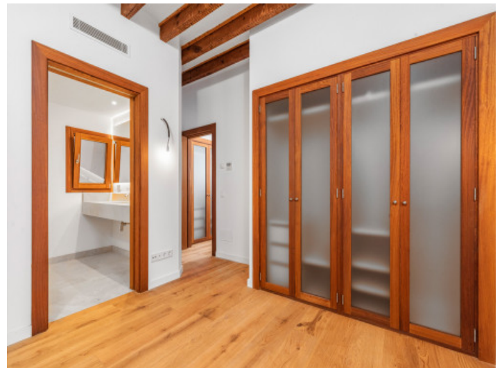
Bedroom with dressing room and bathroom