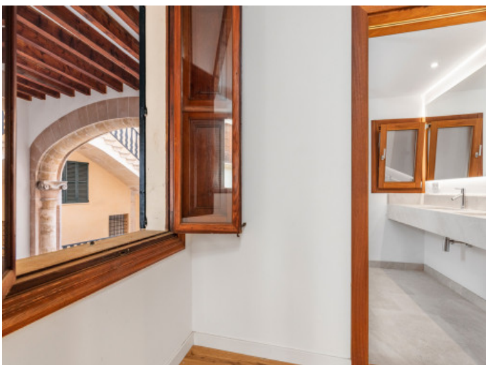
View to the patio of the palace