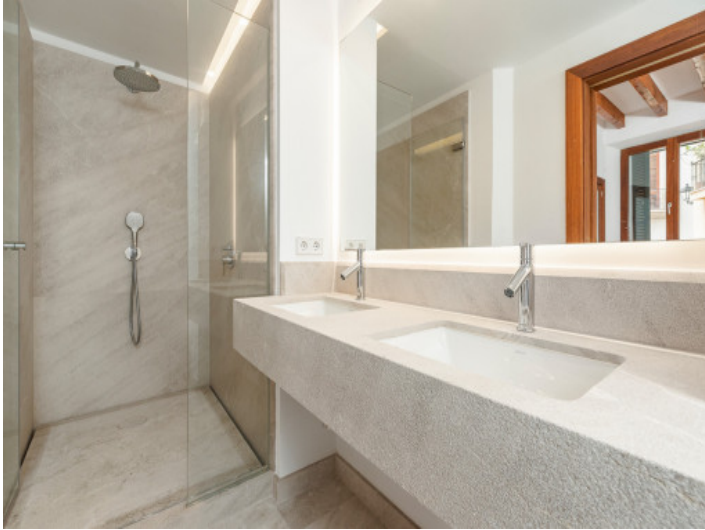
One of 3 modern bathrooms