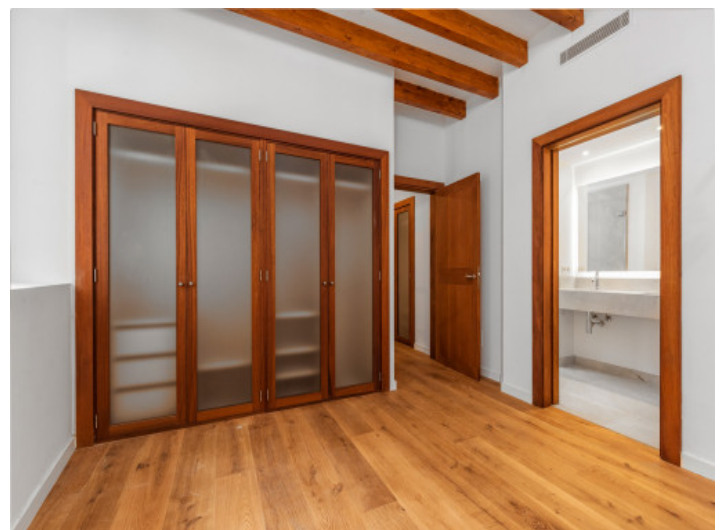
Second beautiful bedroom

All information is correct to the best of our knowledge. Errors and prior sale excepted. This prospectus is purely for information purposes. Only the notarized deed of sale is legally binding.