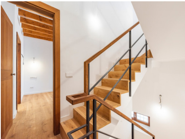
Lower level with bedrooms