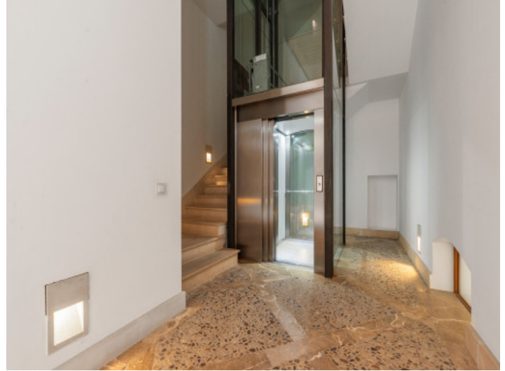
New elevator to the flat