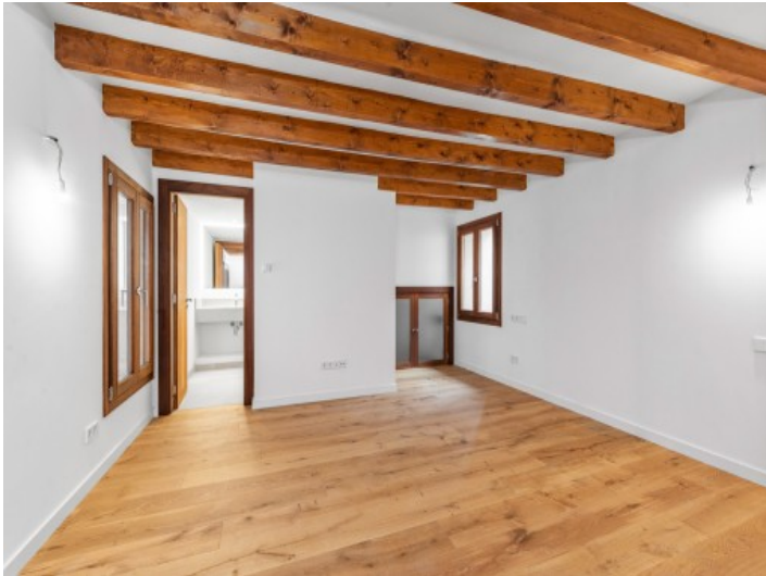
Beautiful bedroom with wooden ceiling beams