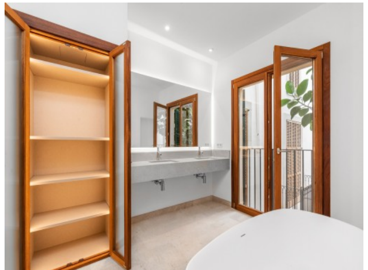
Luxurious bathroom on the ground floor