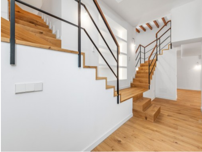
Access to the bedrooms