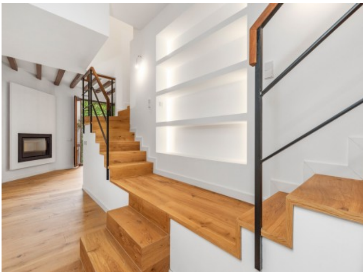
View to a further living area