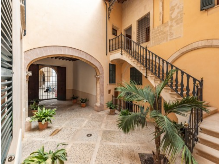
Alternative view of the patio