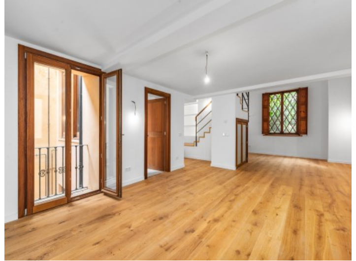
Large dining area with access to the kitchen