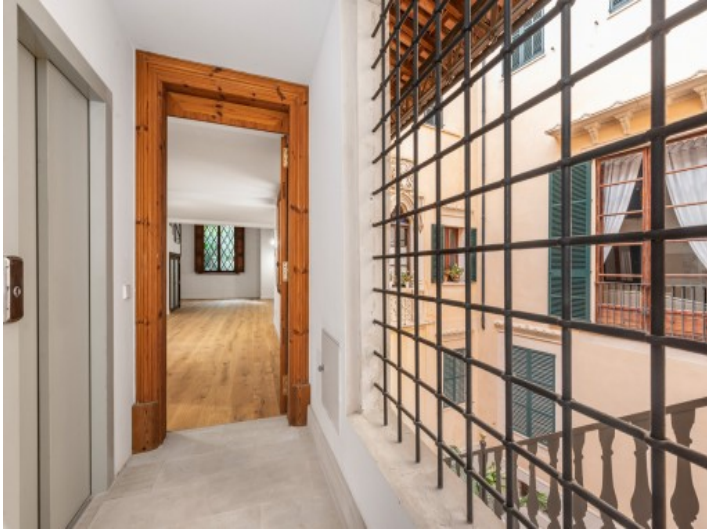
Entrance to the apartment