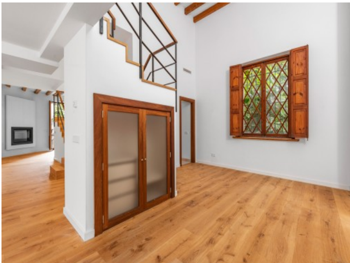
Open living area next to the dining area