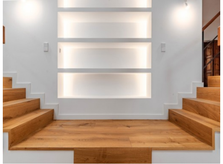
Elegant stairs to the upper floor