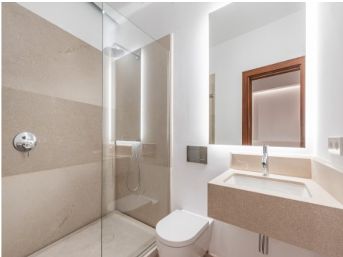
One of 3 modern bathrooms