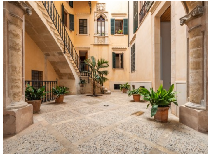
View of the romantic main patio

All information is correct to the best of our knowledge. Errors and prior sale excepted. This prospectus is purely for information purposes. Only the notarized deed of sale is legally binding.