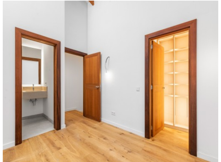
Second bedroom with bathroom