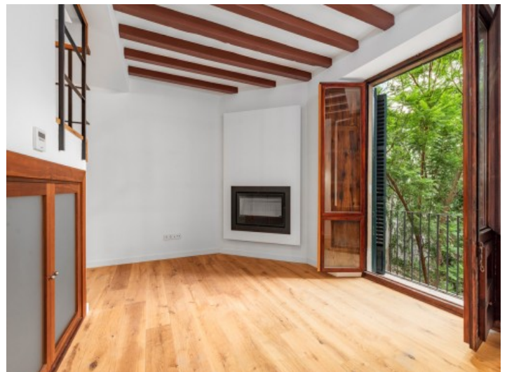
Second living area with fireplace

All information is correct to the best of our knowledge. Errors and prior sale excepted. This prospectus is purely for information purposes. Only the notarized deed of sale is legally binding.