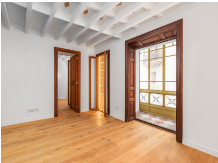
One of 3 beautiful bedrooms