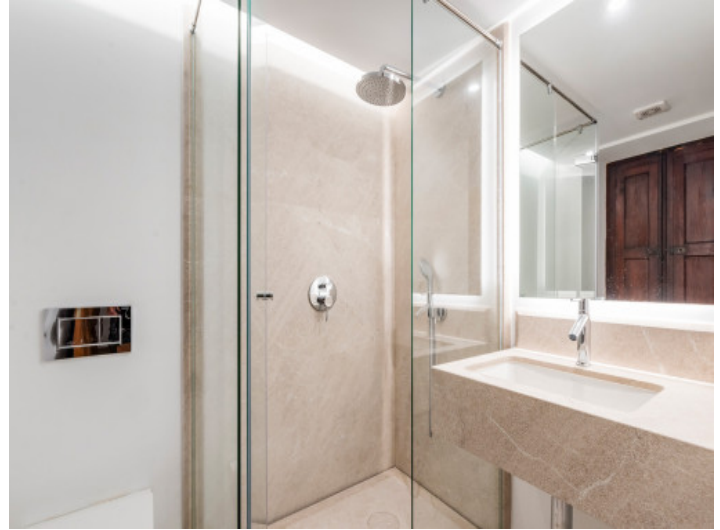
One of 3 modern bathrooms