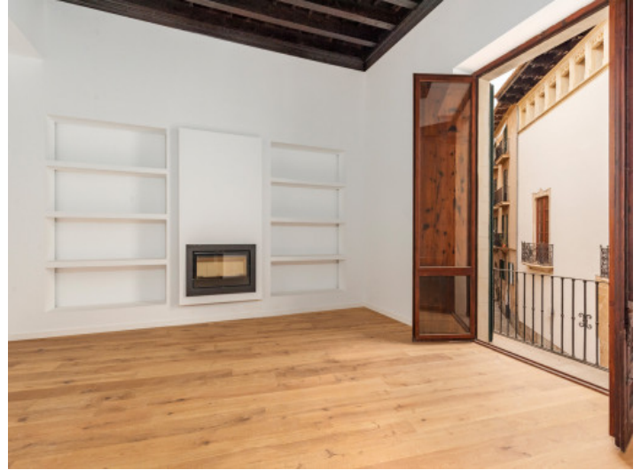
Living area with french balcony