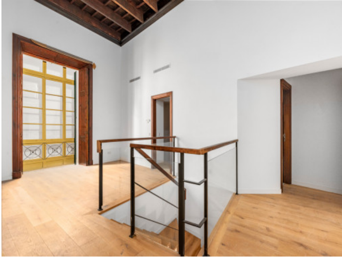
Space for dining area and stairs to the lower level