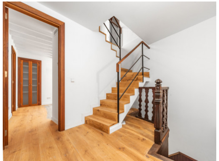
Corridor of the lower level