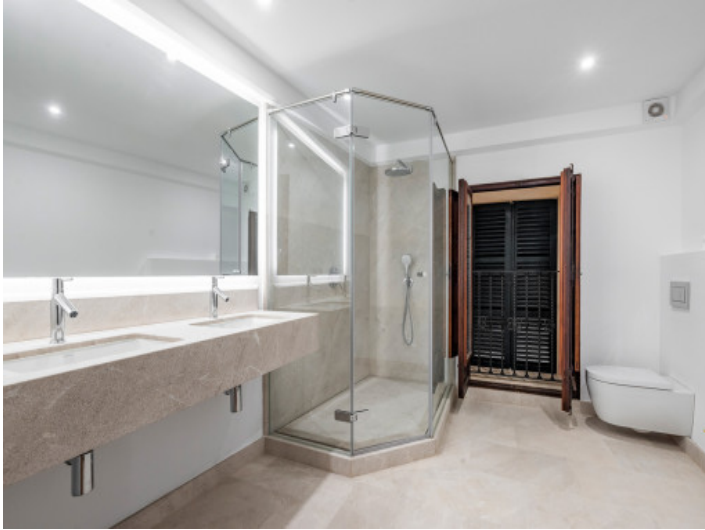
Large shower bathroom