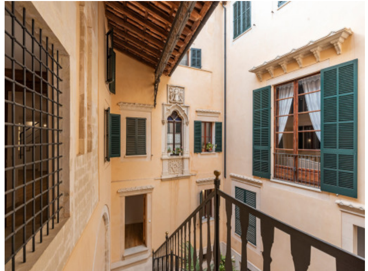
Access to the patio