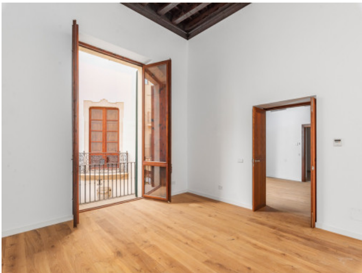
Living area with high ceiling