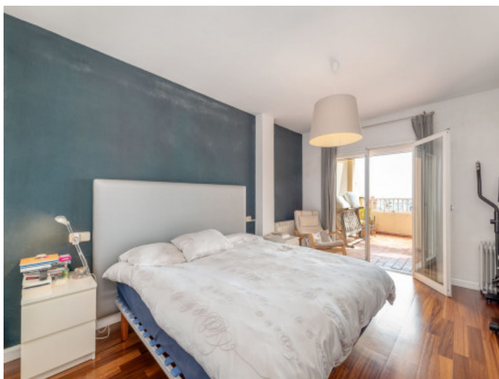
Double bedroom with terrace access

All information is correct to the best of our knowledge. Errors and prior sale excepted. This prospectus is purely for information purposes. Only the notarized deed of sale is legally binding.