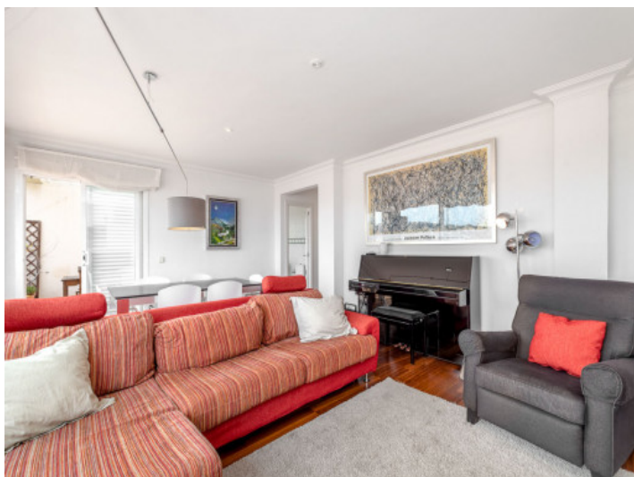
Living and dining area with terrace access