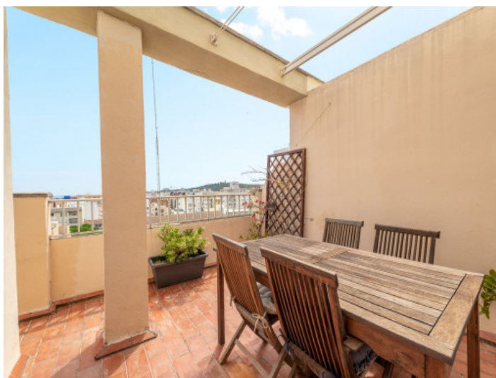
Dining area on the terrace