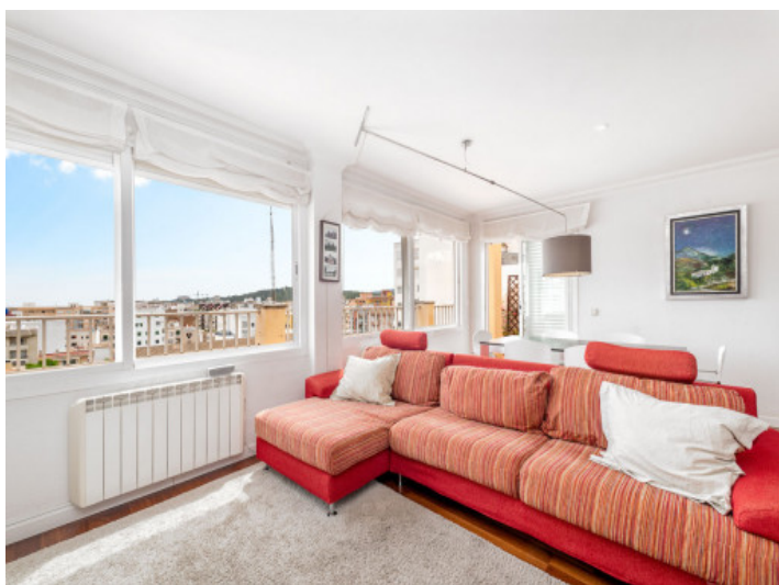
Light flooded living and dining area