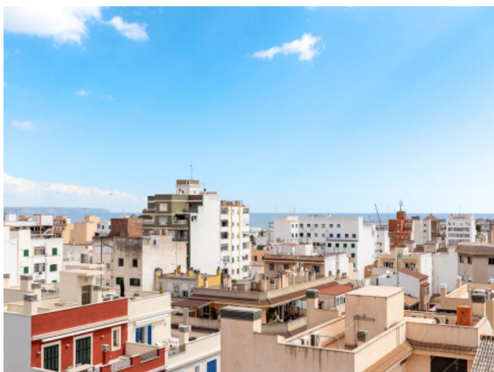
Views as far as te sea