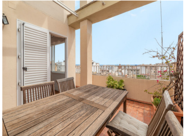
Roof terrace with sea views