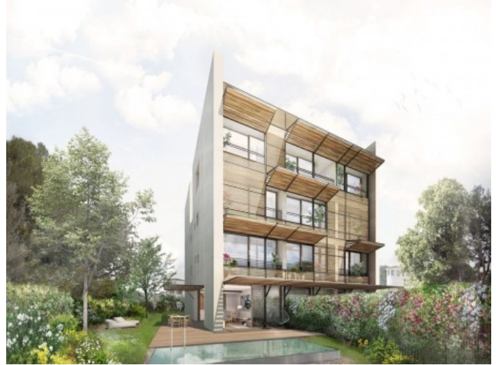
Exterior view of the complex