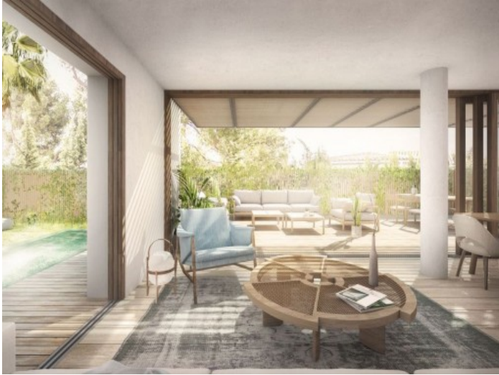
Iconic newly built apartment complex in Palma