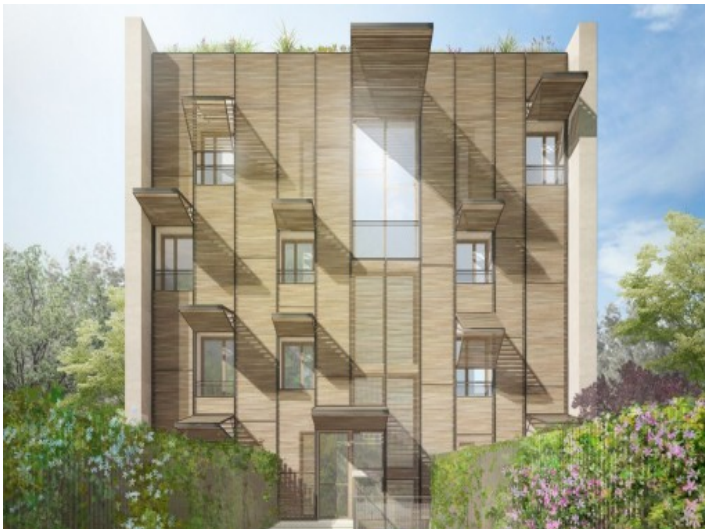
Exterior view of the complex