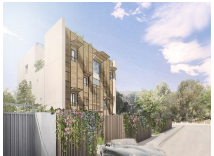
Exterior view from the street

All information is correct to the best of our knowledge. Errors and prior sale excepted. This prospectus is purely for information purposes. Only the notarized deed of sale is legally binding.