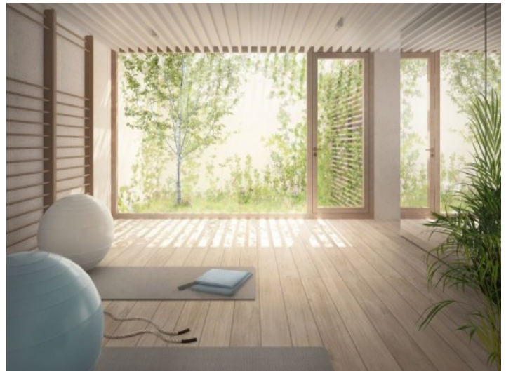
Airconditioned fitness area

All information is correct to the best of our knowledge. Errors and prior sale excepted. This prospectus is purely for information purposes. Only the notarized deed of sale is legally binding.