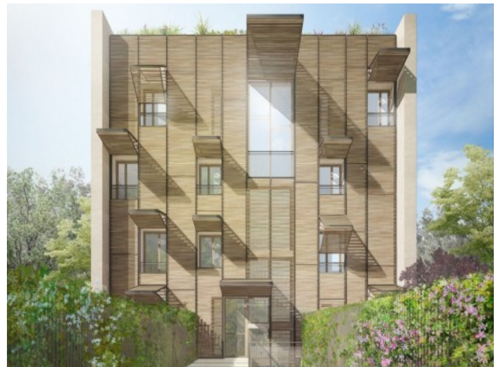
Exterior view of the complex