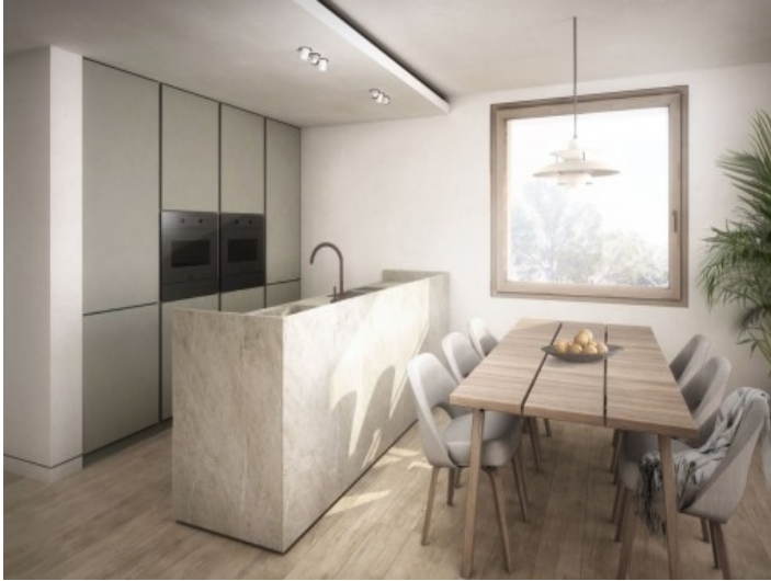
Fully equipped kitchen with cooking island