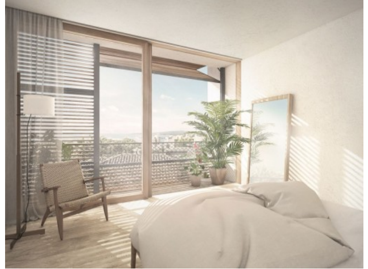
Spacious double bedroom