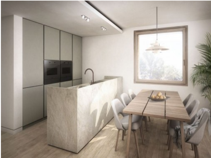
Fully equipped kitchen with cooking island