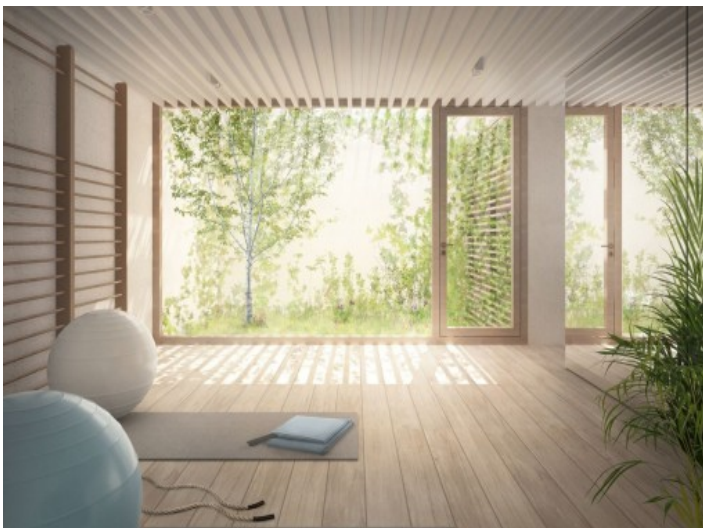
Fitness area with air condition