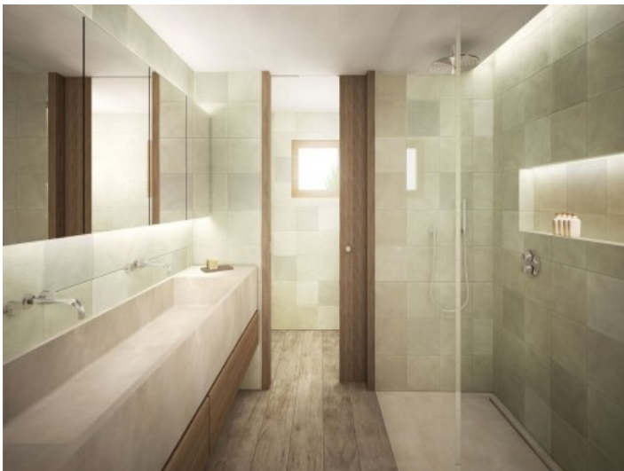
Noble bathroom en suite with walk-in shower