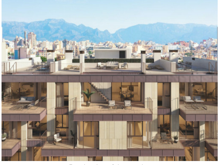
Exterior view of the complex

All information is correct to the best of our knowledge. Errors and prior sale excepted. This prospectus is purely for information purposes. Only the notarized deed of sale is legally binding.