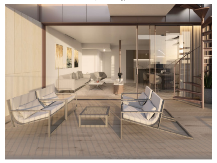
Terrace with sitting area