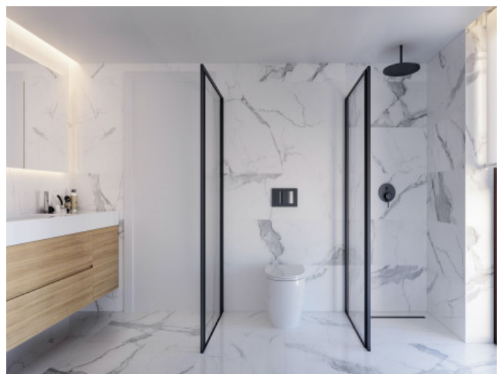
Bathroom - Shine