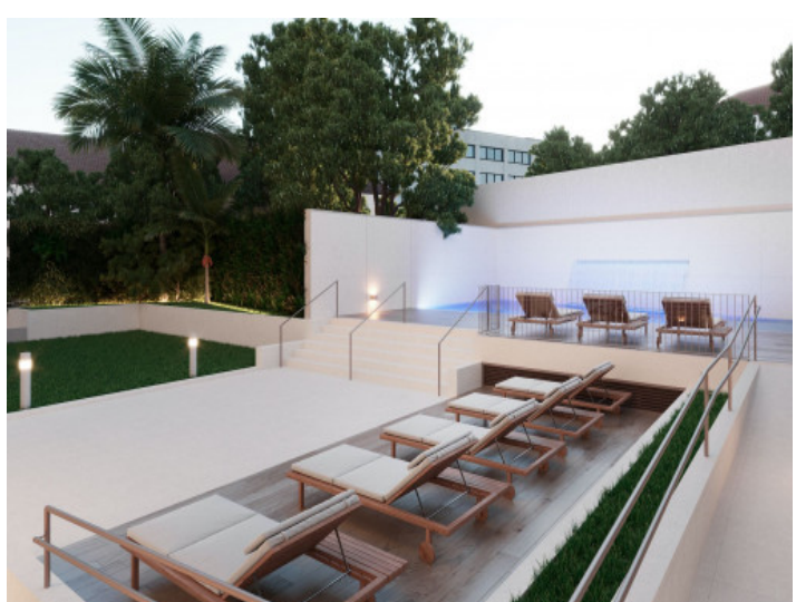
Community pool area