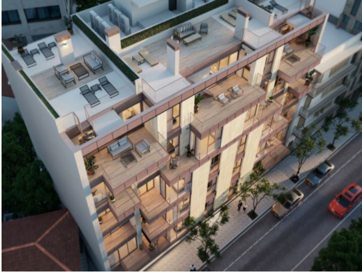
Exterior view of the residential complex