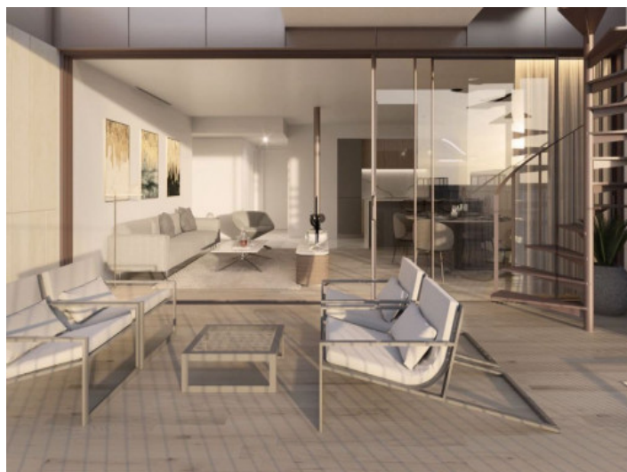
Terrace with sitting area

All information is correct to the best of our knowledge. Errors and prior sale excepted. This prospectus is purely for information purposes. Only the notarized deed of sale is legally binding.