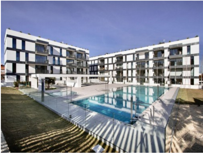
Complex and communal pool