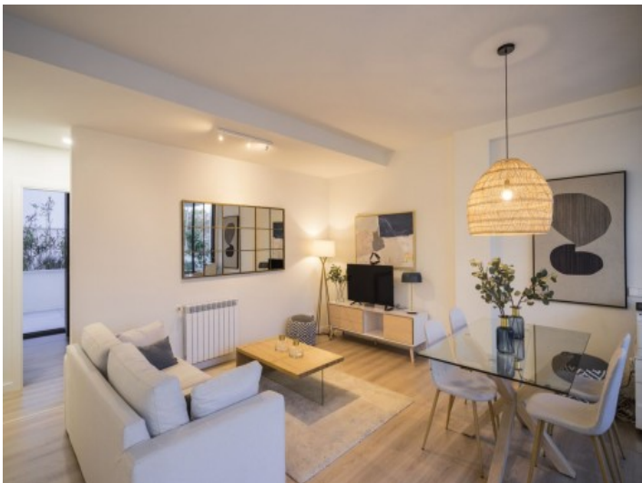
Beautiful living area