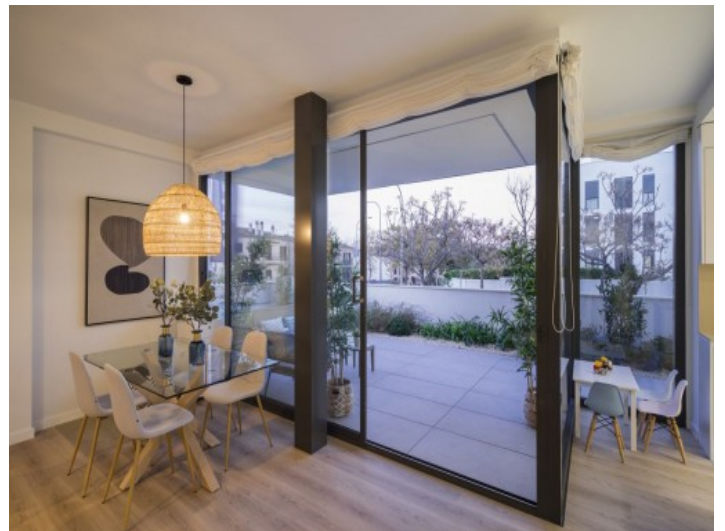
Dining area with terrace access