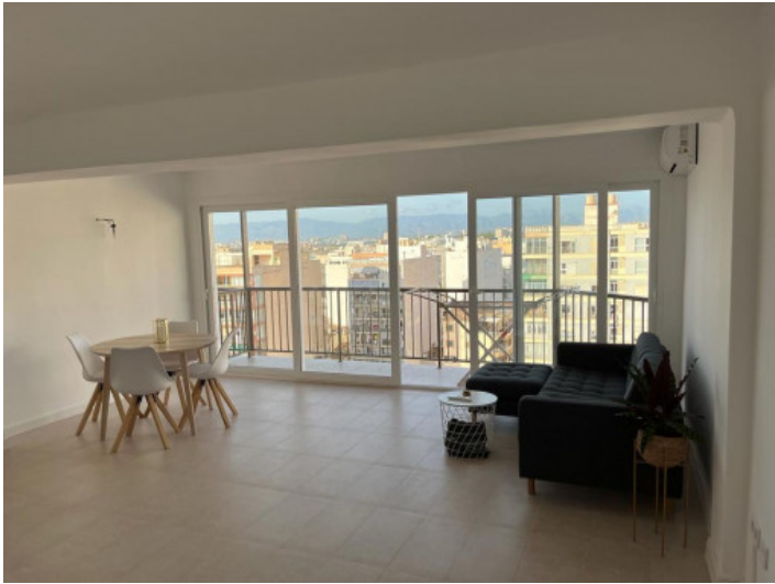
Living area with large window facade