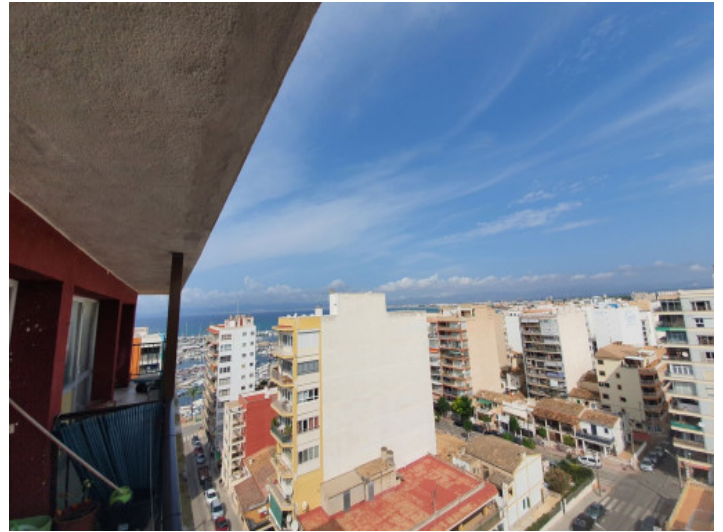
Views as far as the sea