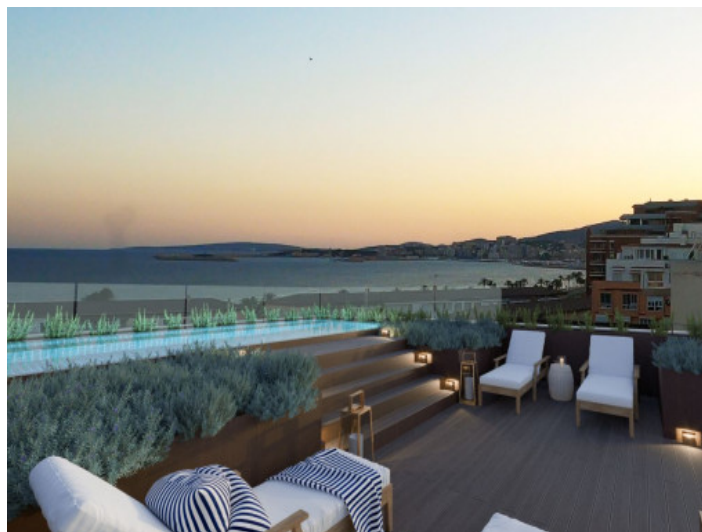
Terrace, Pool and sea views

All information is correct to the best of our knowledge. Errors and prior sale excepted. This prospectus is purely for information purposes. Only the notarized deed of sale is legally binding.