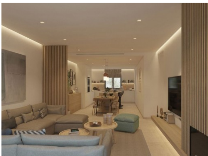
Open, cozy living area