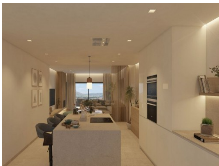
Kitchen with cooking island