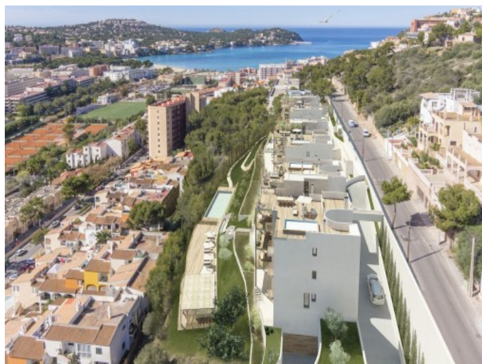
Stunning view of the city

All information is correct to the best of our knowledge. Errors and prior sale excepted. This prospectus is purely for information purposes. Only the notarized deed of sale is legally binding.