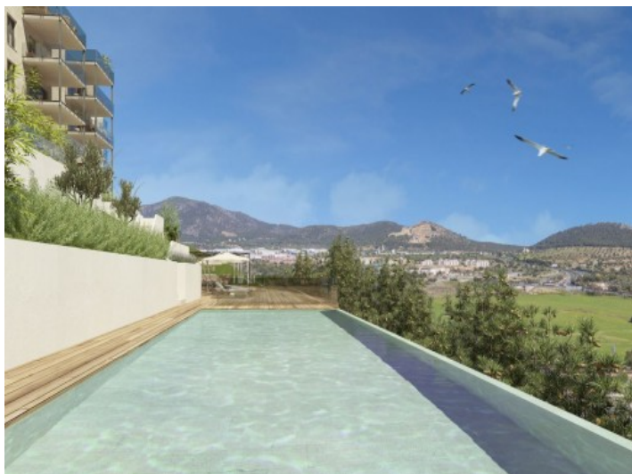
View of the community pool