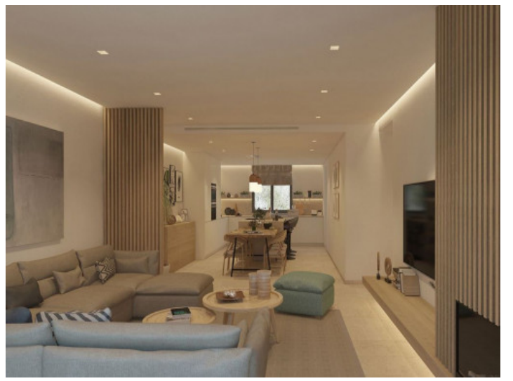
Open, cozy living area