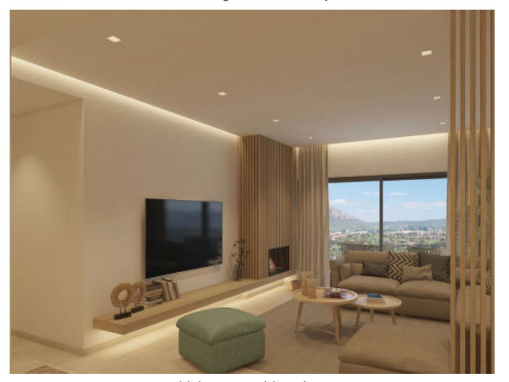
Living area with a view