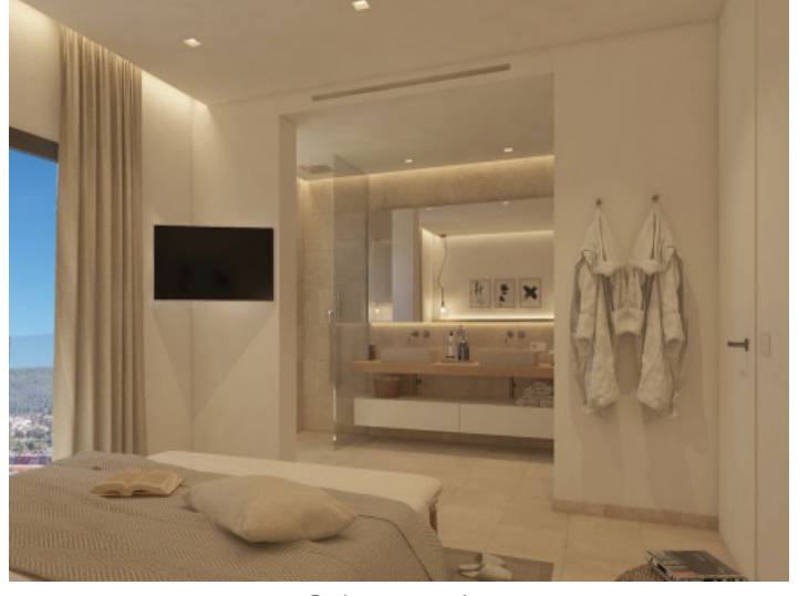
Bedroom en suite

All information is correct to the best of our knowledge. Errors and prior sale excepted. This prospectus is purely for information purposes. Only the notarized deed of sale is legally binding.