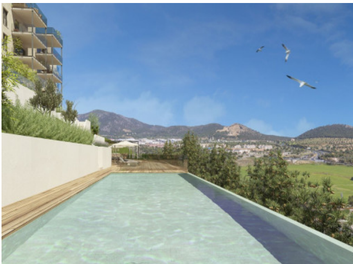
View of the community pool