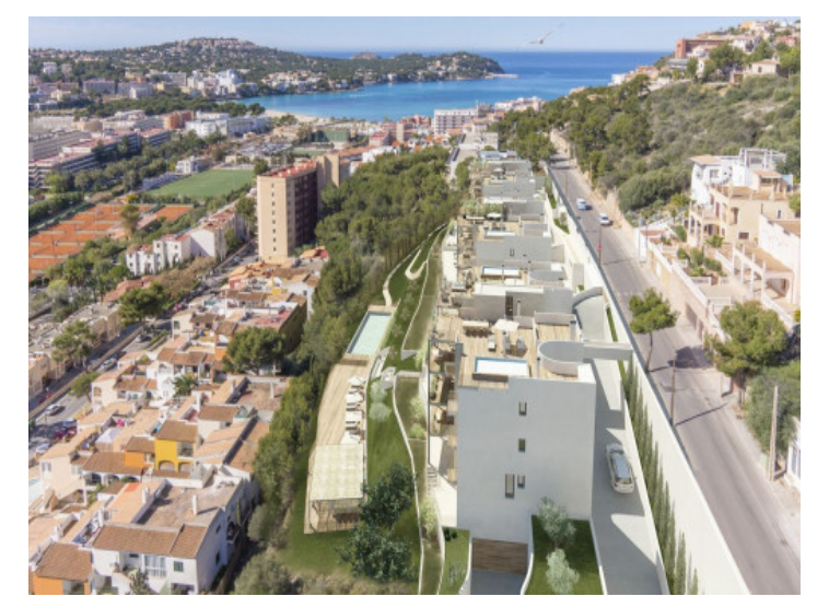
Stunning view of the city