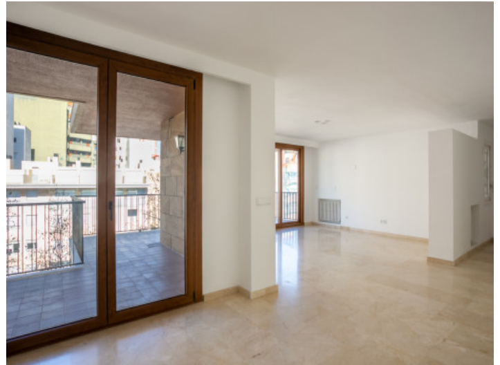
Direct balcony access