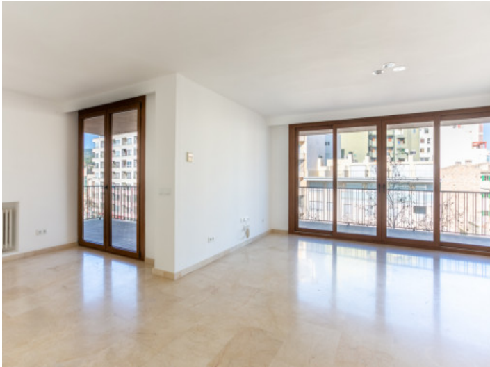
Large living area