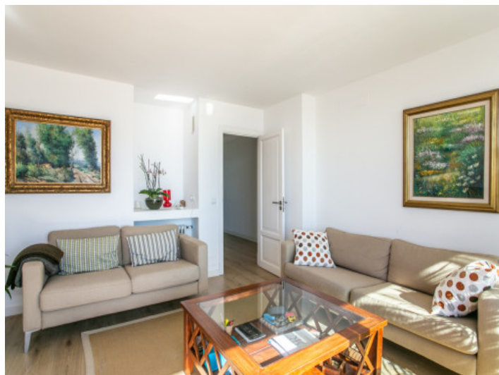
Alternative view of the room