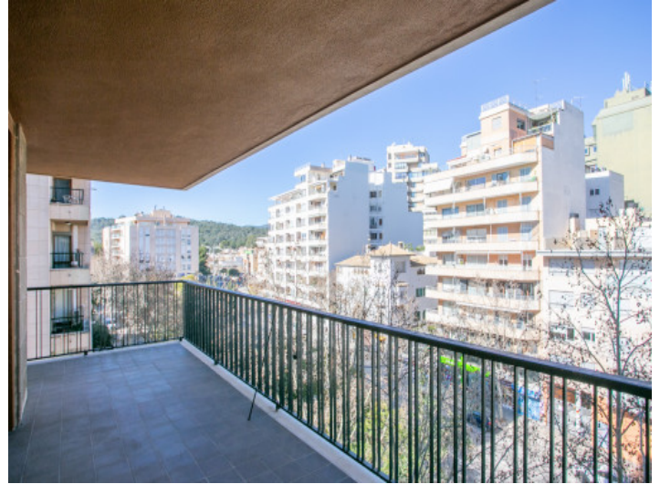
Large, covered balcony