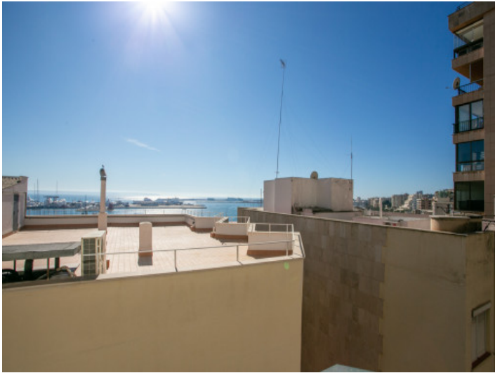
Sea view from the balcony