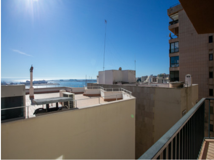
Balcony with sea views