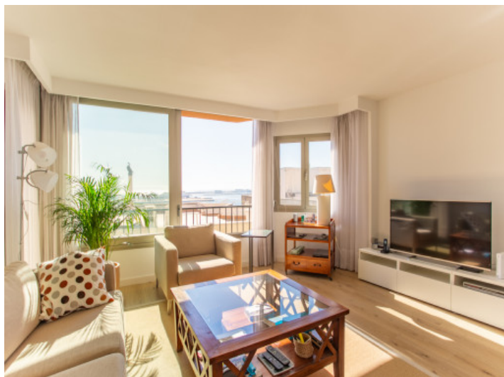
Sunny bedroom used as a living room