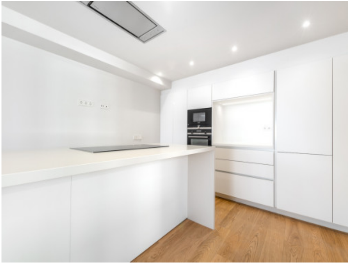
Modern kitchen with cooking island