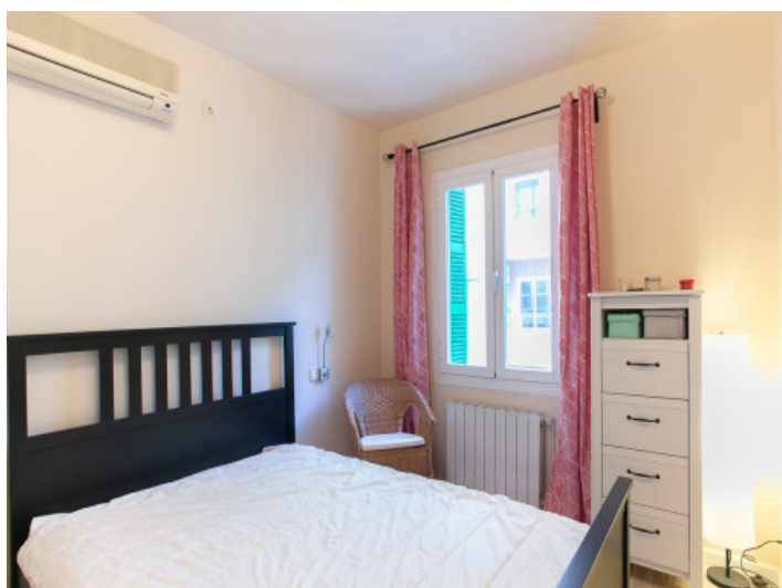
One of 2 bedrooms