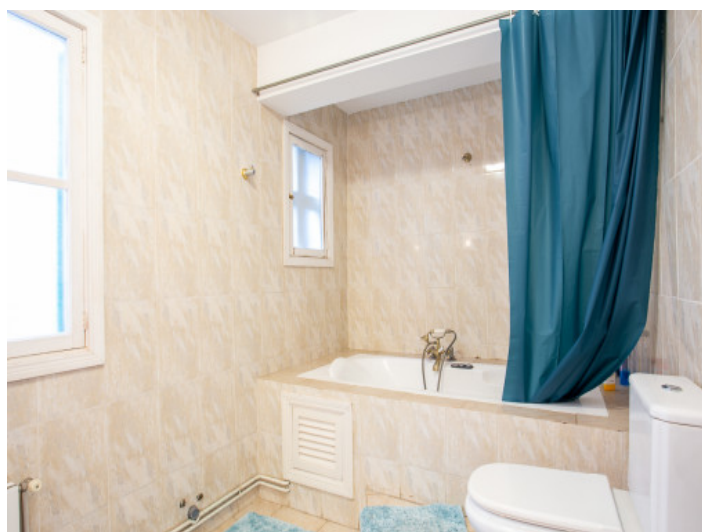
Bathroom with bathtub

All information is correct to the best of our knowledge. Errors and prior sale excepted. This prospectus is purely for information purposes. Only the notarized deed of sale is legally binding.