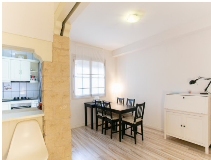
Beautiful dining area