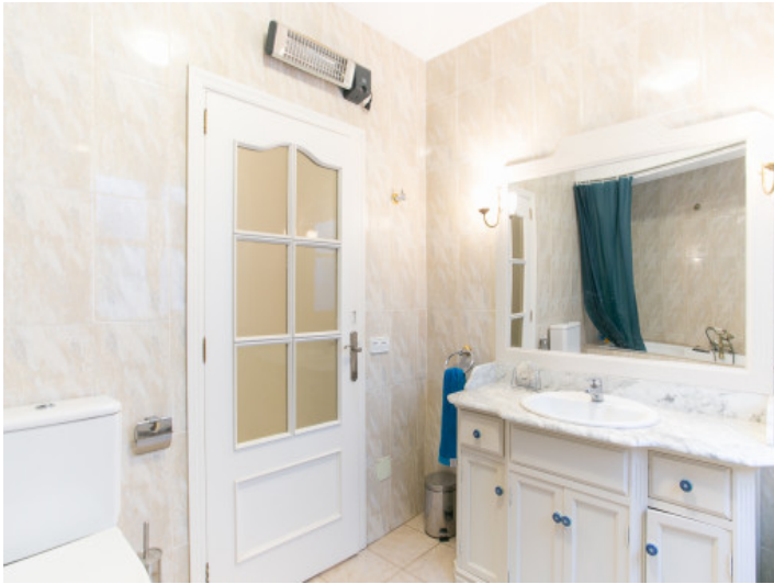
Alternative view of the bathroom