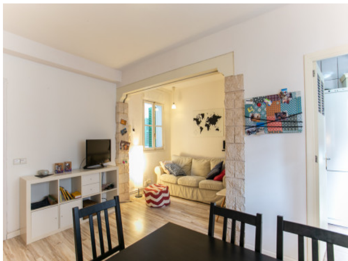
View to the cozy living area