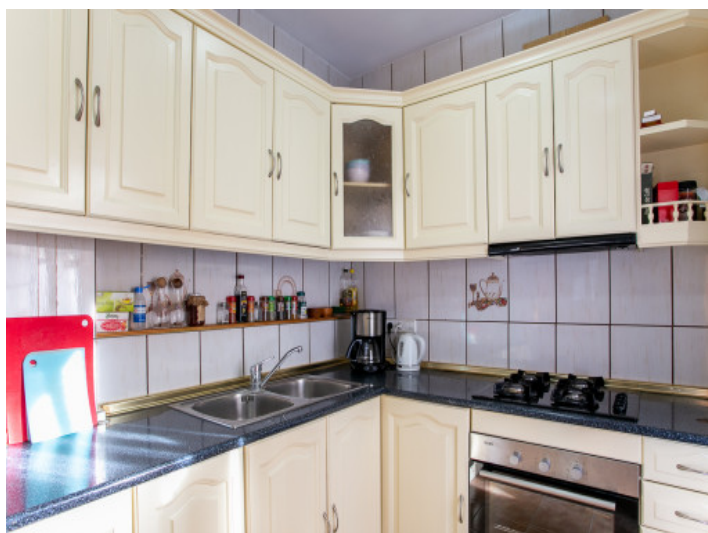
Fully equipped kitchen