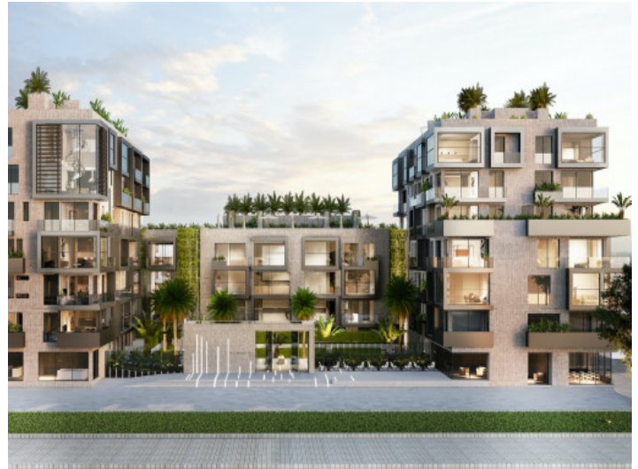
Exterior view of the residential complex