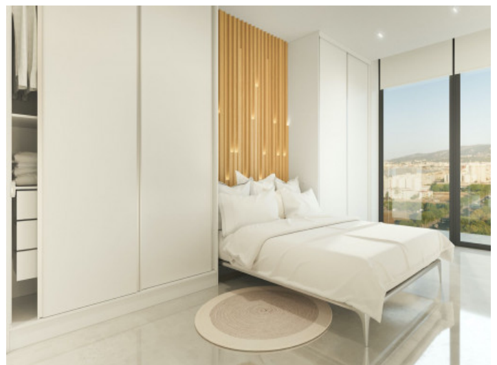
Inviting double bedroom

All information is correct to the best of our knowledge. Errors and prior sale excepted. This prospectus is purely for information purposes. Only the notarized deed of sale is legally binding.