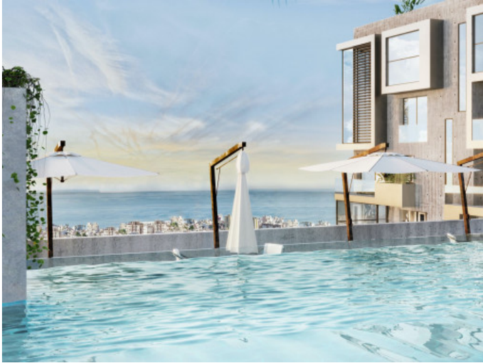
Impressive roof top pool