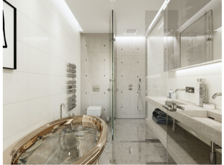
Alternative bathroom style