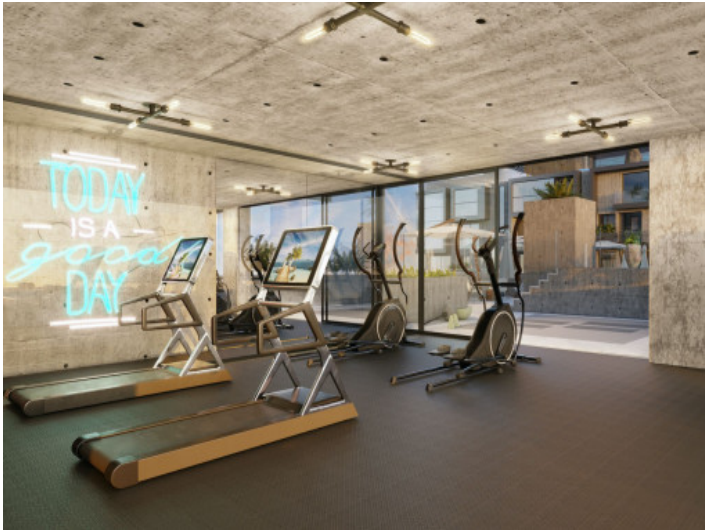
Community gym area