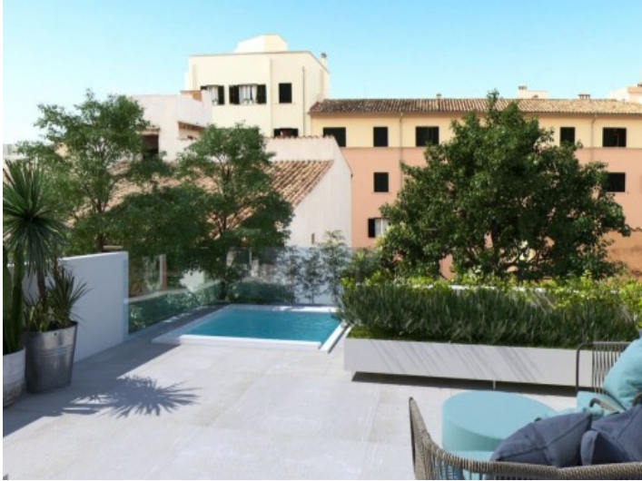
Exclusive apartment with pool in Santa Catalina