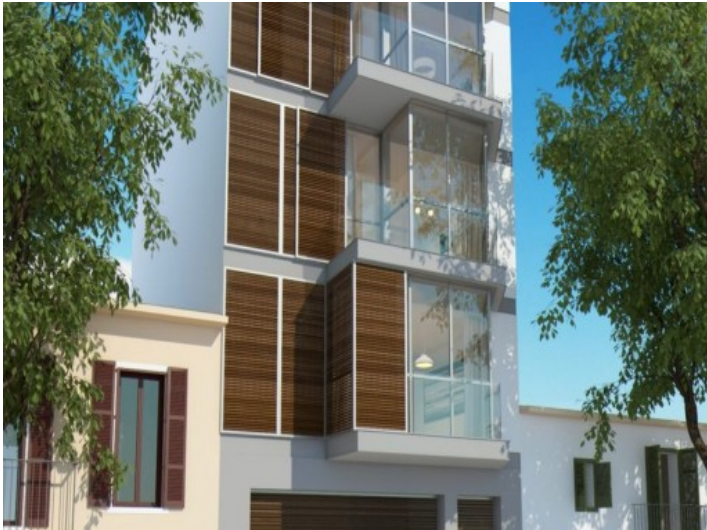
Exterior views of the residential complex