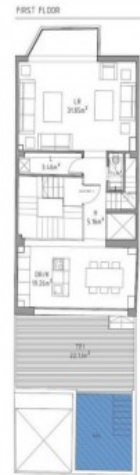
Construction plan of the lower floor