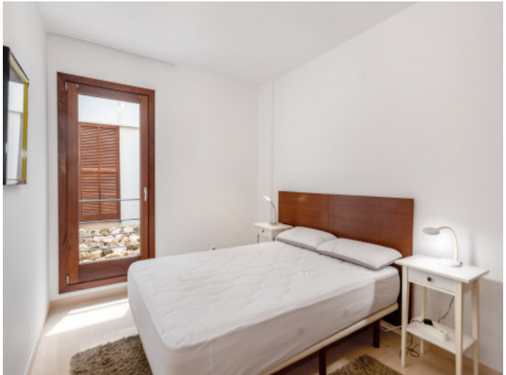
A total of 2 bedrooms