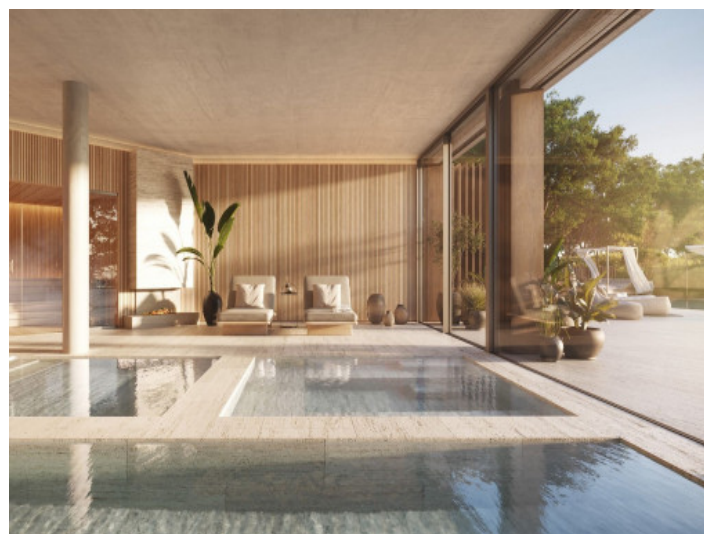
Large indoor pool