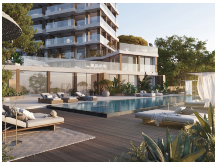
Fantastic communal pool area