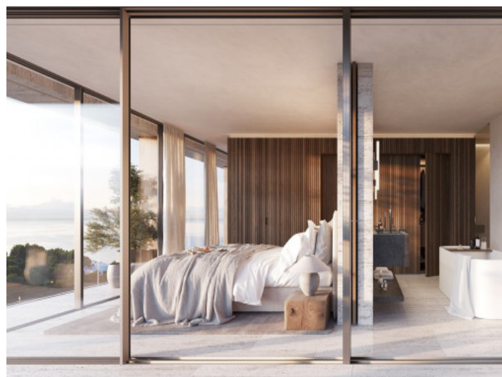
Light-flooded bedroom with sea views