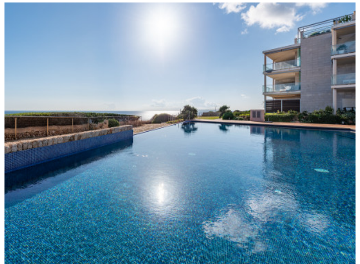
Large communal pool