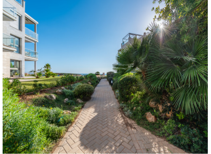
Lovely communal garden