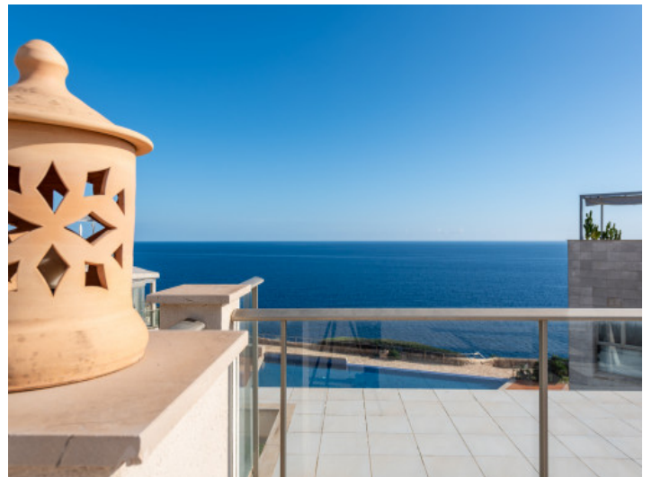
Roof terrace with breathtaking sea views