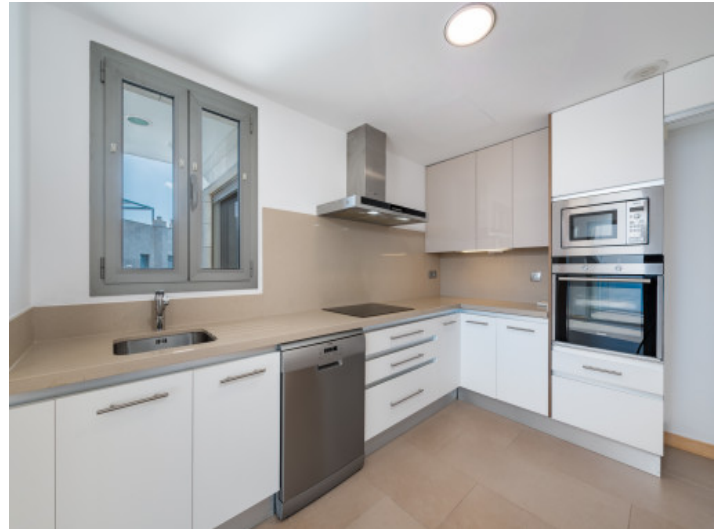
Fully equipped, modern kitchen