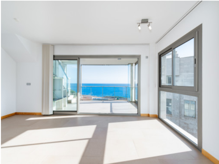
Light-flooded living area