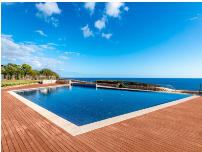
Well-maintained pool area