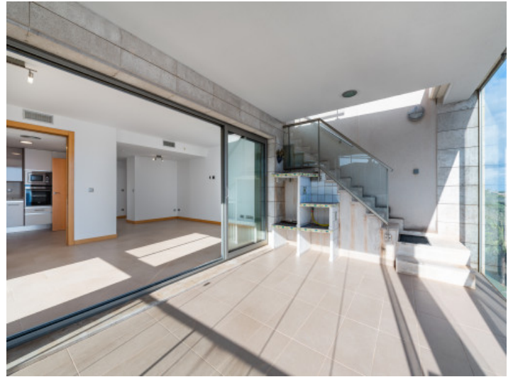
Covered terrace off the living area