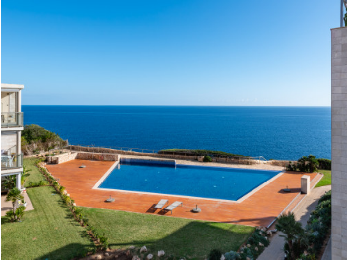
Fantastic sea views