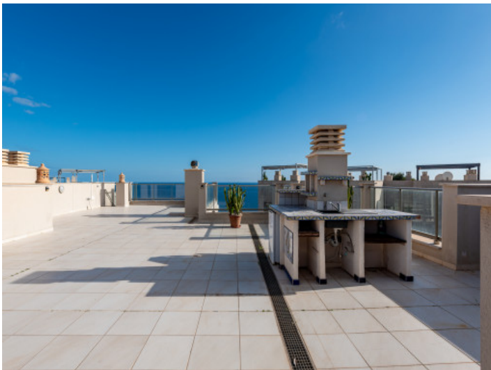
Large roof terrace