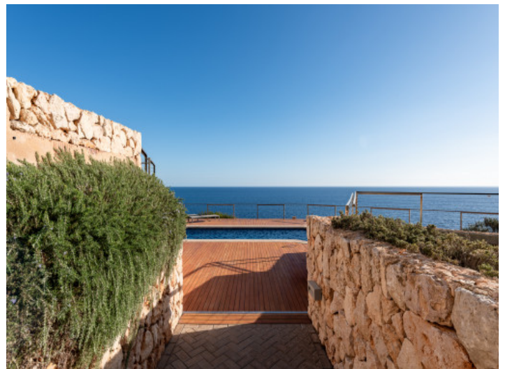
Path leading to the pool

All information is correct to the best of our knowledge. Errors and prior sale excepted. This prospectus is purely for information purposes. Only the notarized deed of sale is legally binding.