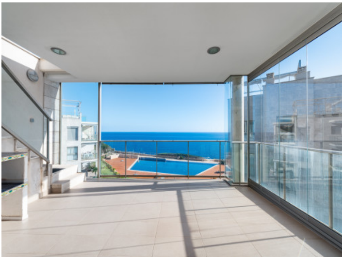
Superb terrace with great sea views