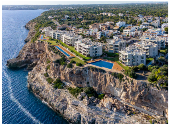
Bird's eye view

All information is correct to the best of our knowledge. Errors and prior sale excepted. This prospectus is purely for information purposes. Only the notarized deed of sale is legally binding.