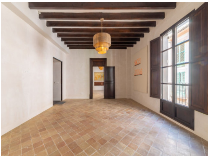
Original wooden beams and tiles