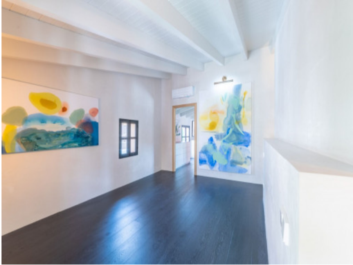
Bedroom with bathroom en suite