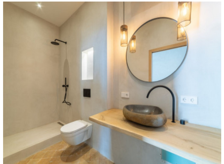
Bathroom en suite