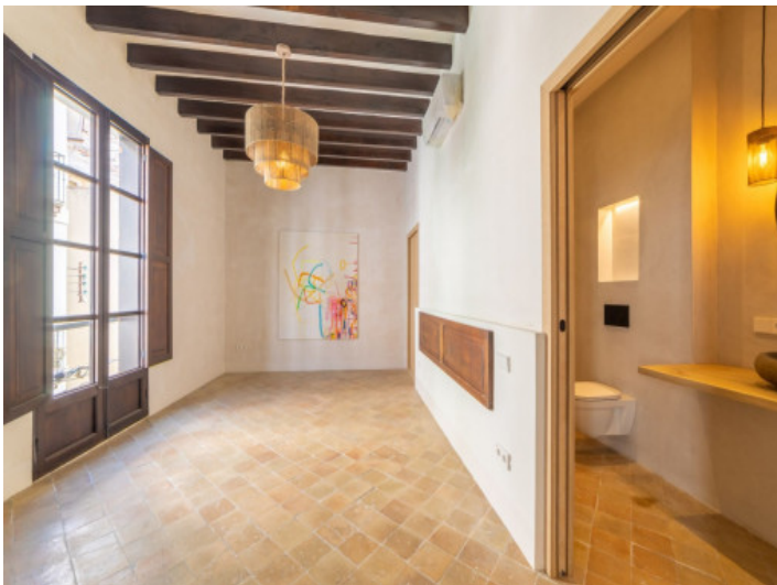
Bedroom with oldtown charme