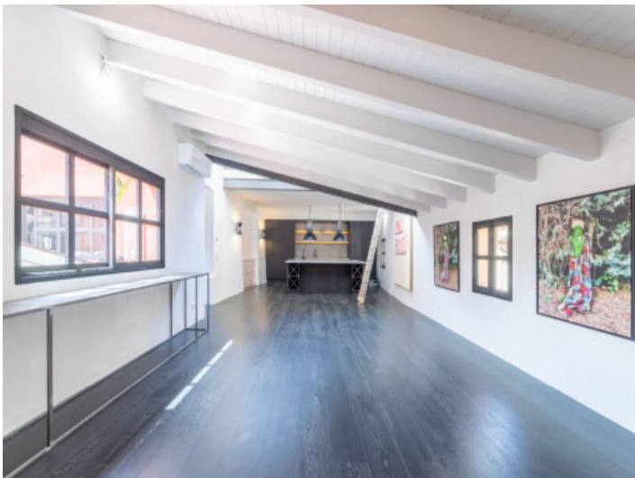
Kitchen and dining area