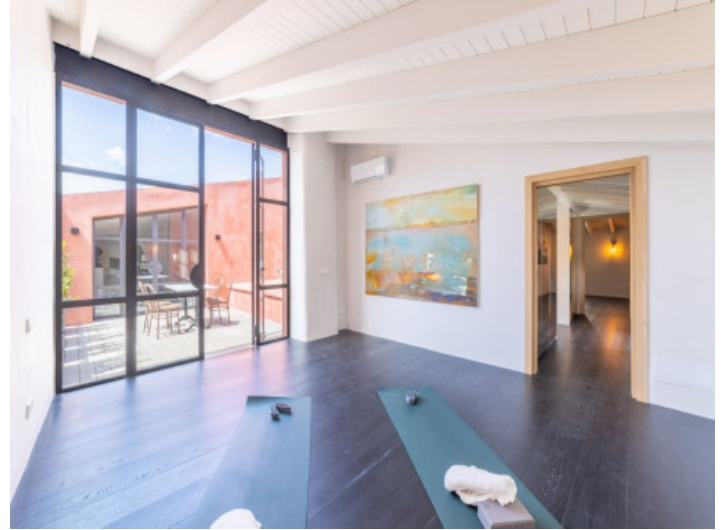
Gym or study room