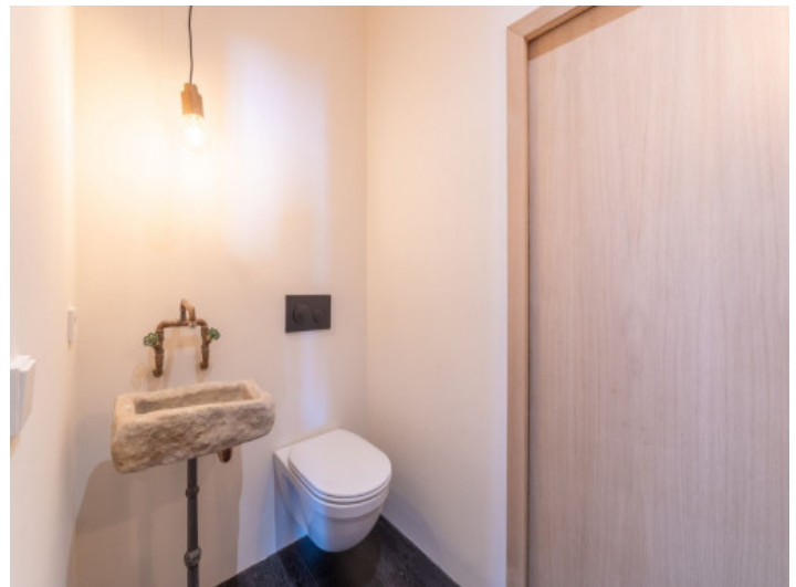
Guest toilet next to the staircase