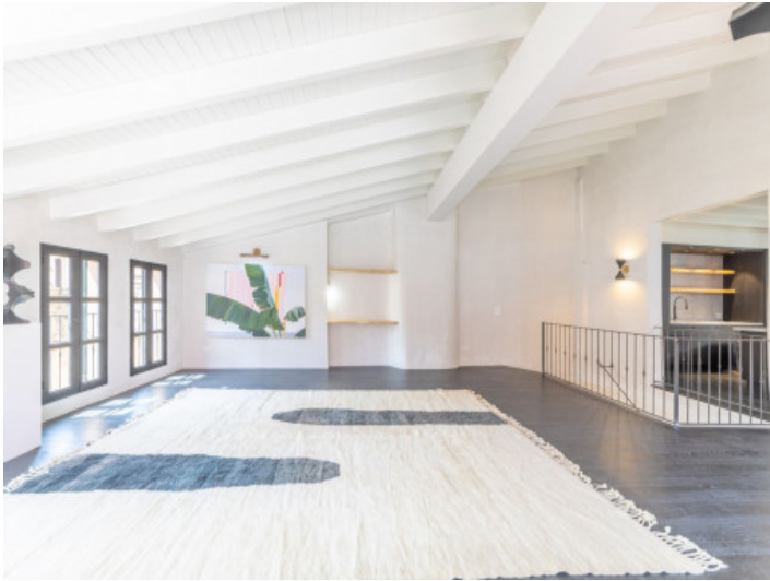
Bright living area