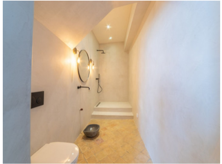
Bathroom with shower