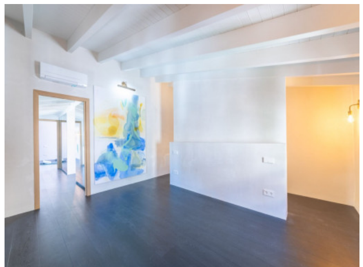
One of 4 comfortable bedrooms

All information is correct to the best of our knowledge. Errors and prior sale excepted. This prospectus is purely for information purposes. Only the notarized deed of sale is legally binding.