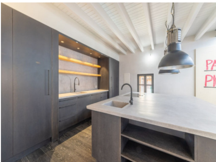
Kitchen with plenty of storage space