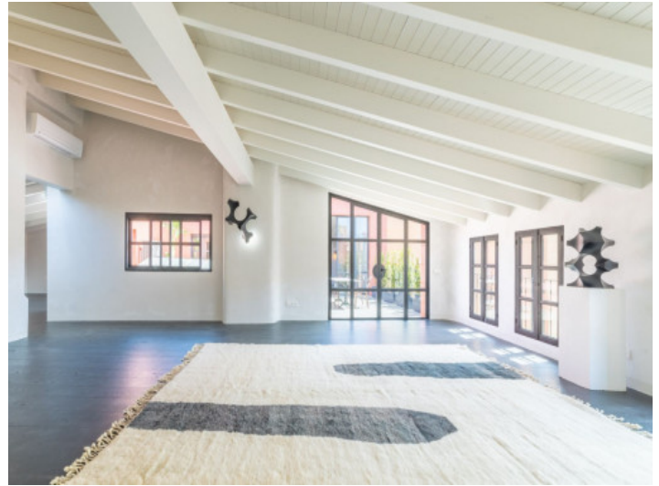
Large living area