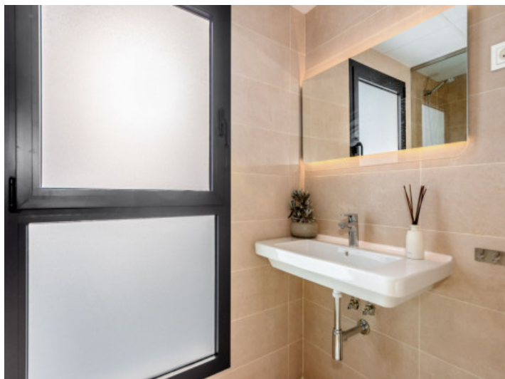
Penthouse with 2 bathrooms