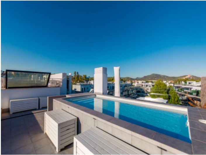
Private pool rooftop