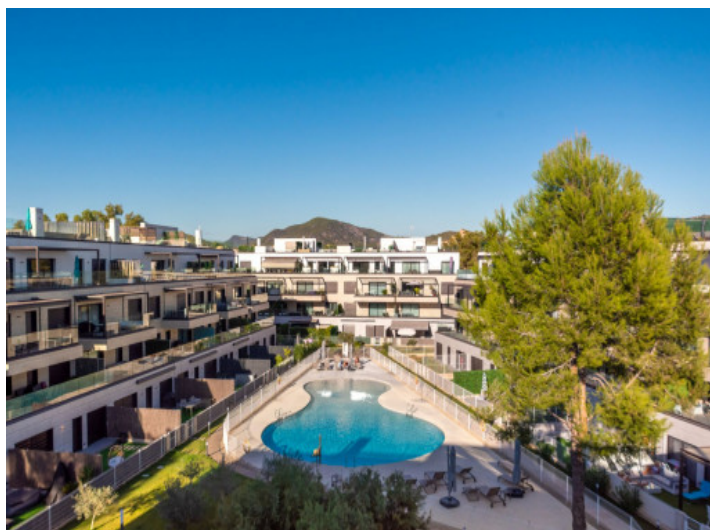
View on the community area