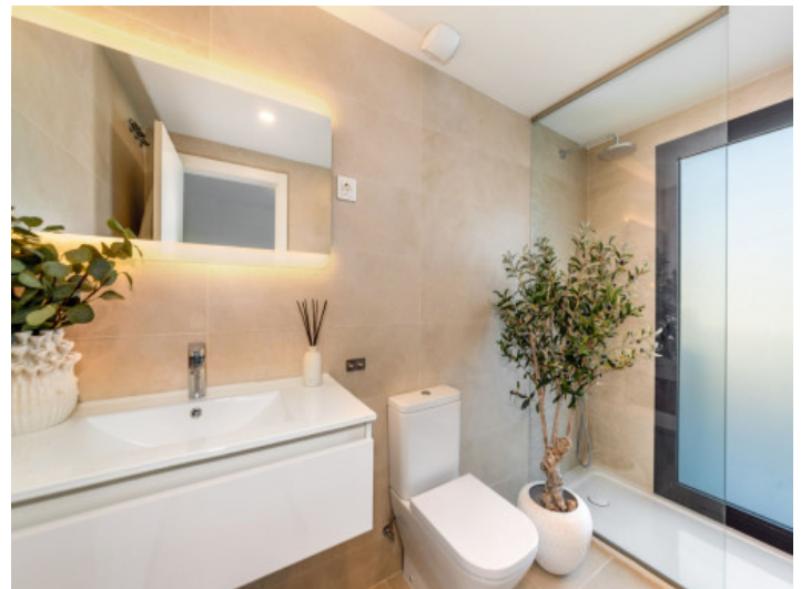
En suite bathroom