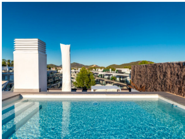
Private pool rooftop