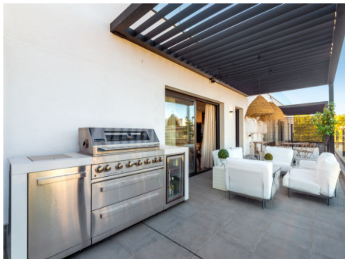
BBQ area terrace