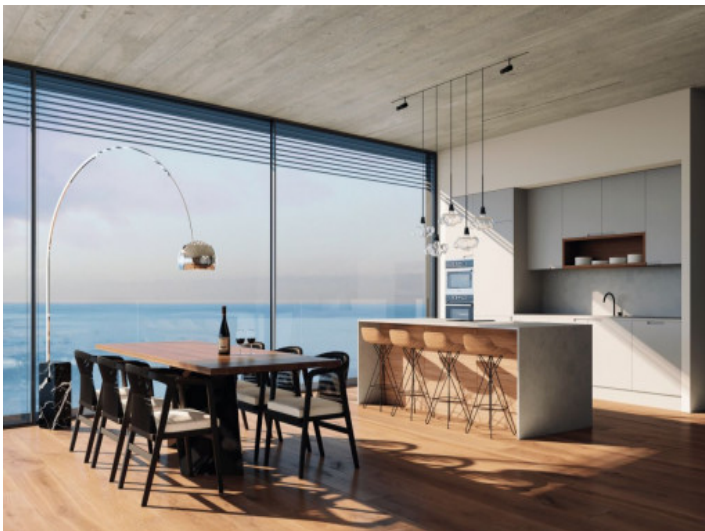
Dining area and kitchen