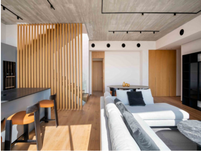
Open room layout