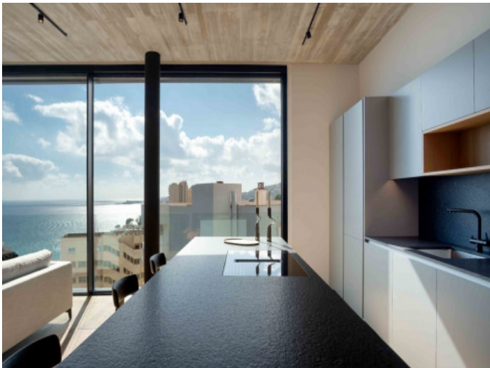
Views from the kitchen