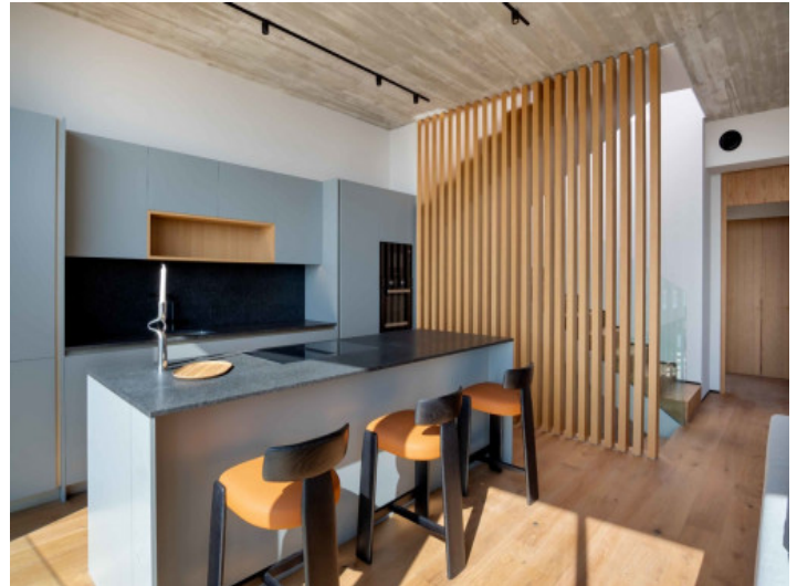
Large kitchen island