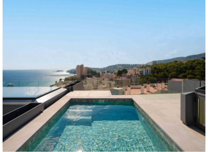
Rooftop with pool