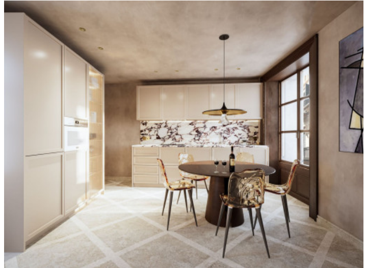
Dining area and kitchen