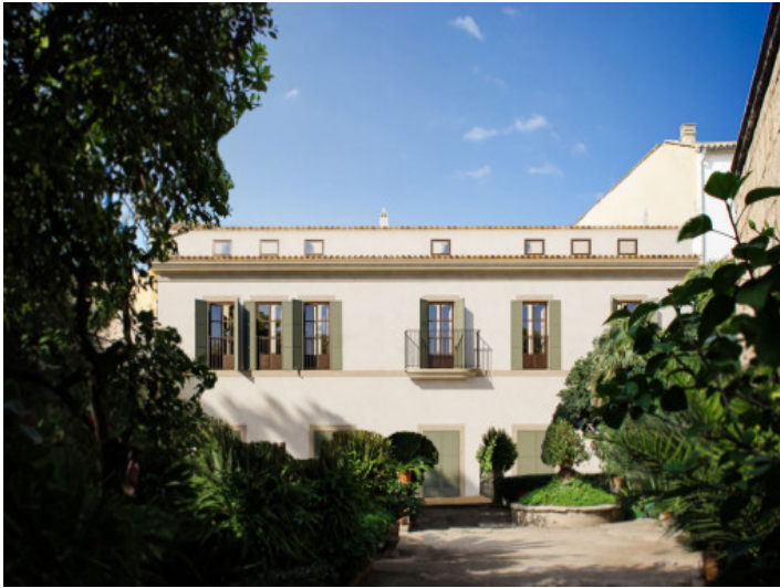
Exterior view of the building