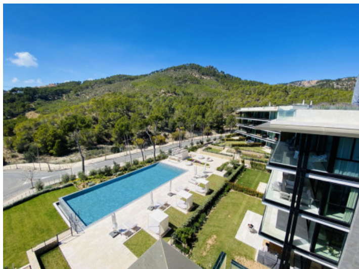
View from the rooftop to the community