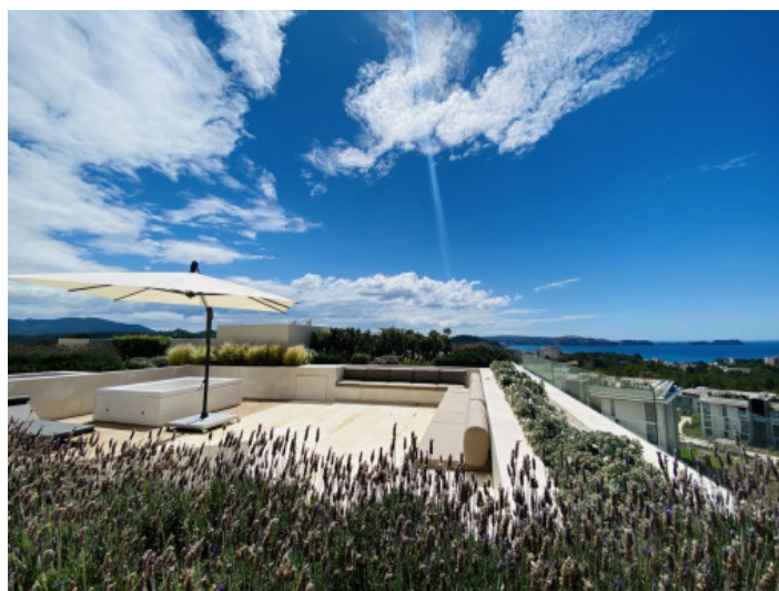
Rooftop terrace with views