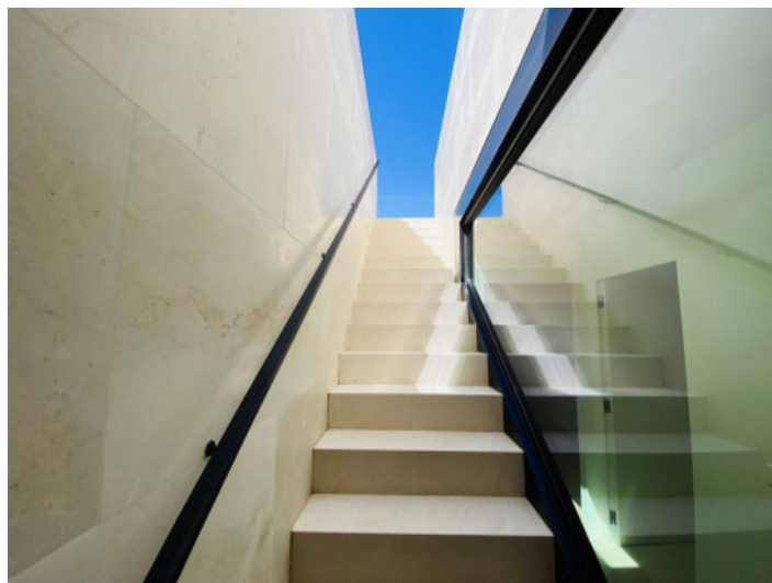
Staircase to the rooftop