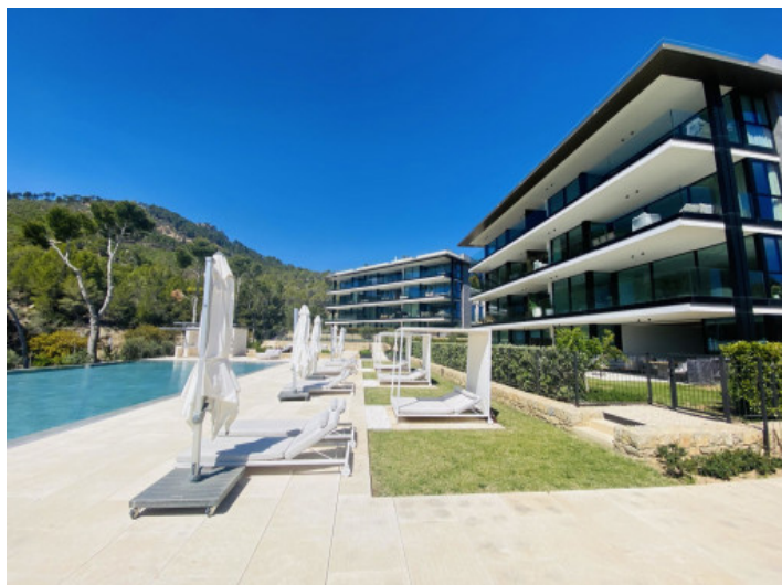
Community pool and garden