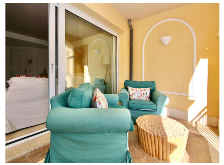
Lounge area on the balcony

PORTA MALLORQUINA® Your home. Our passion.