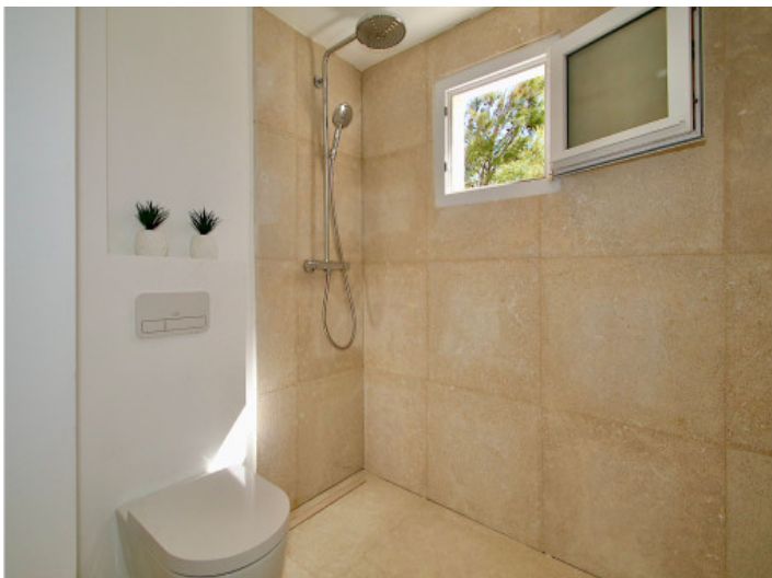
Bathrooms in a modern style