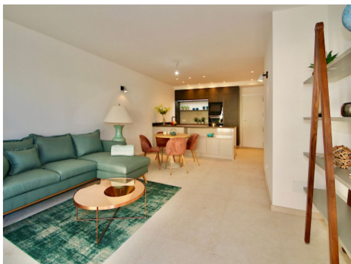
Bright and cozy living and dining area