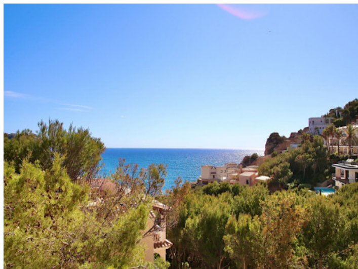
The penthouse is close to the harbour and its restaurants