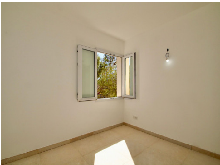
The 2nd bedroom