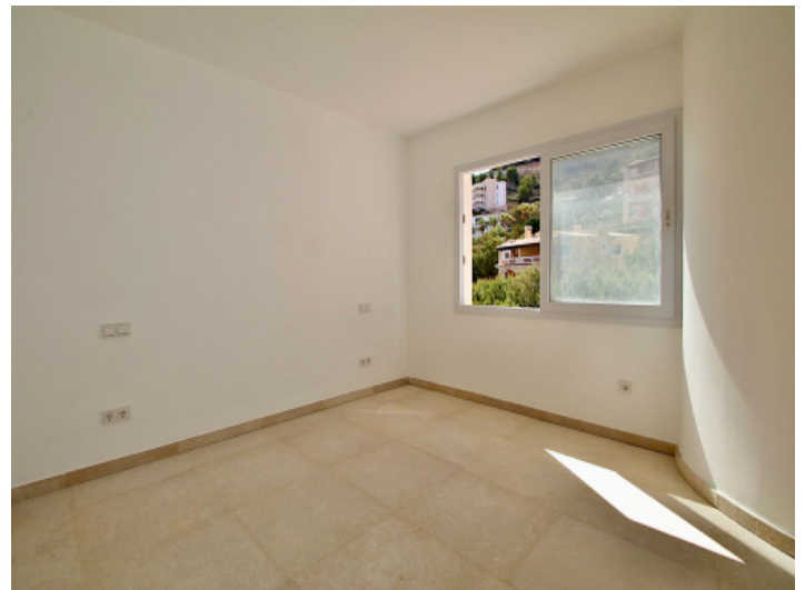
Natural stone floors and underfloor heating in the whole flat