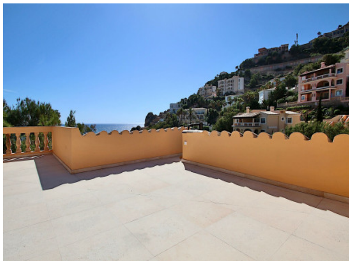
Rooftop terrace with amazing views