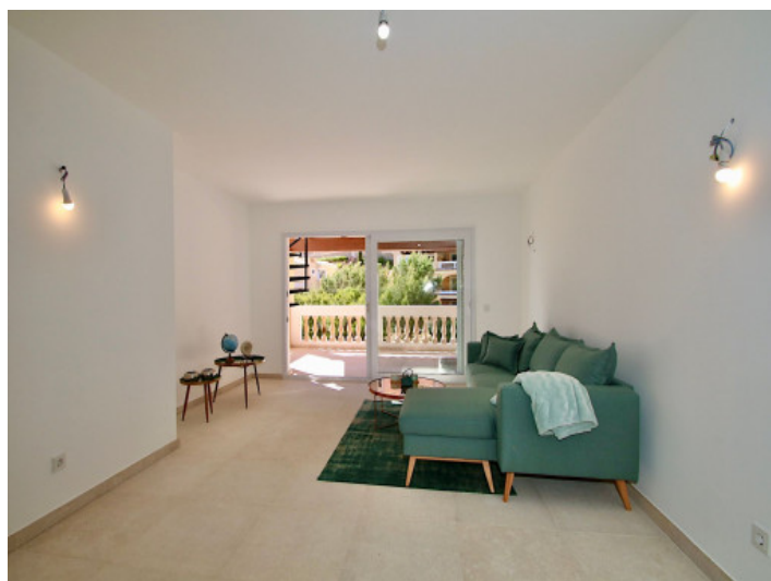
Living area with porched terrace