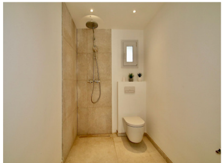
Hans Grohe and Duravit sanitary equipment

All information is correct to the best of our knowledge. Errors and prior sale excepted. This prospectus is purely for information purposes. Only the notarized deed of sale is legally binding.