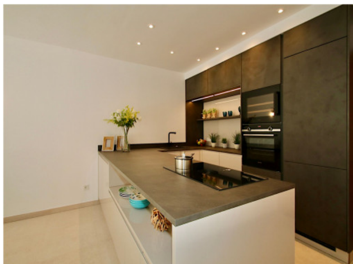
Modern kitchen with kitchen island