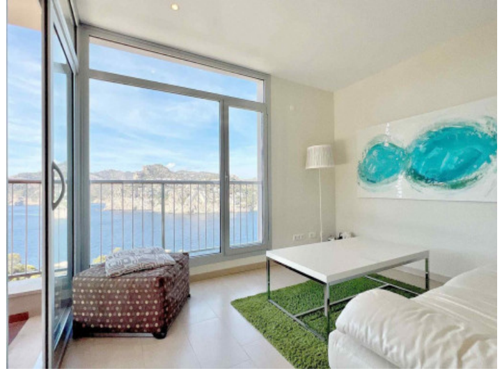
Bright living area with sea views