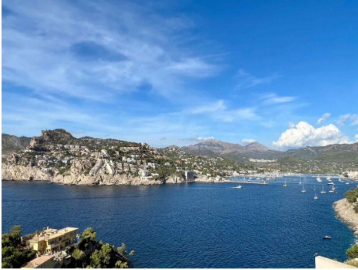
Impressive sea views