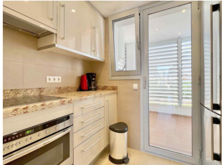
Fully fitted kitchen