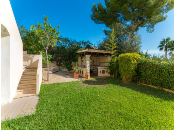
Garden with BBQ area