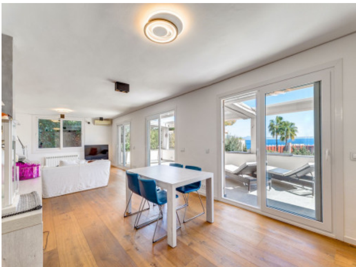
Bright dining area