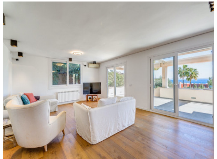
Living area with direct terrace access