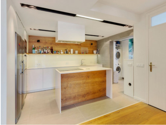
Kitchen with island