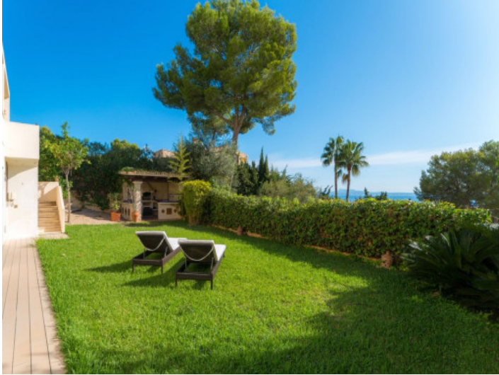
Private garden with sea views