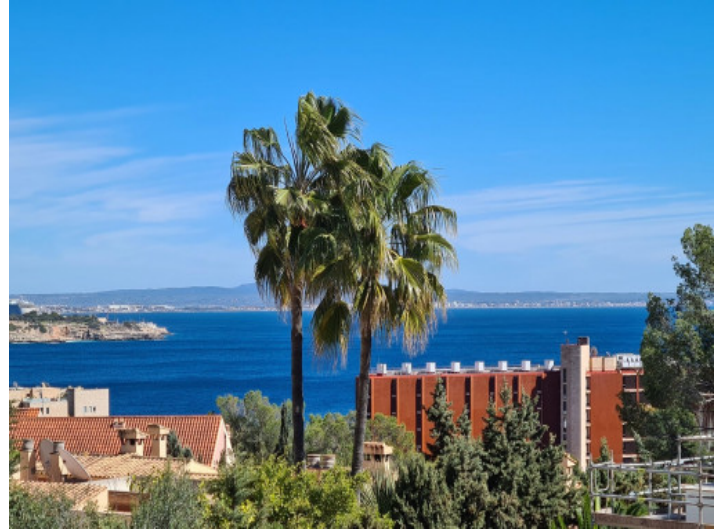
Beautiful sea views