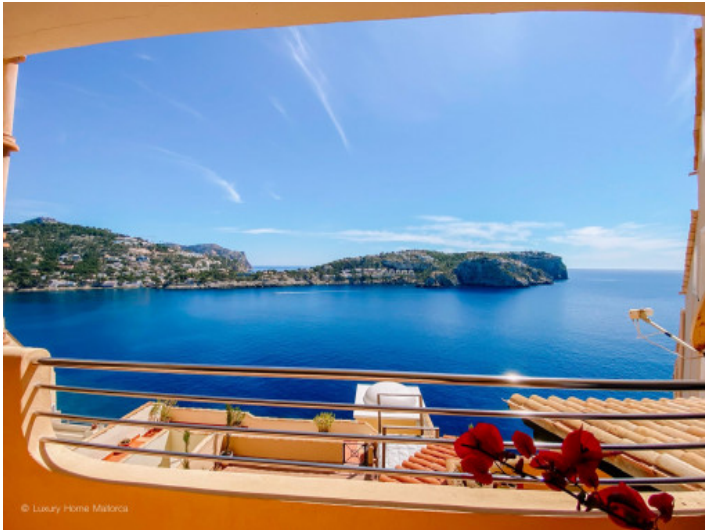
Sea view terrace