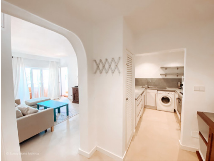
Living area / Kitchen