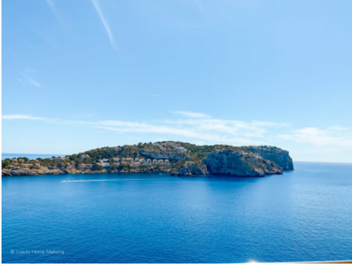
Panorama sea views