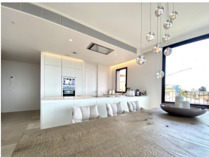
Open living and dining area