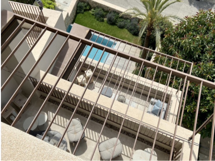
View to the pool