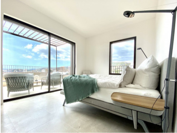
Light flooded bedroom