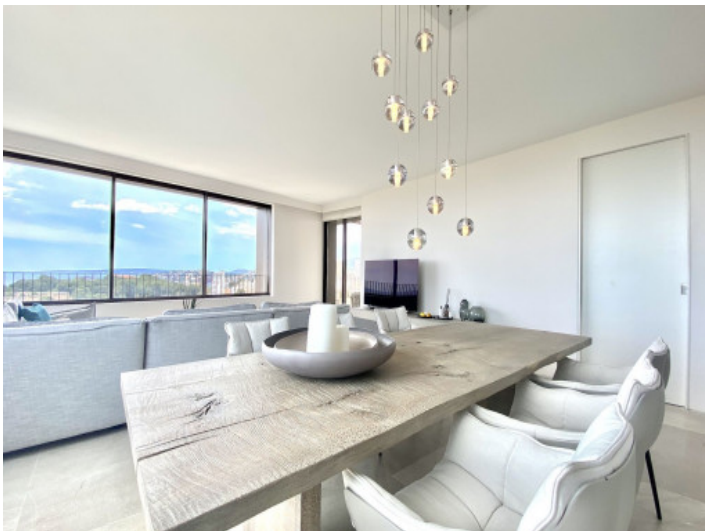
Open living and dining area