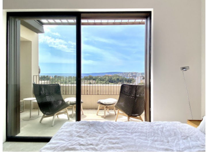
View to the balcony