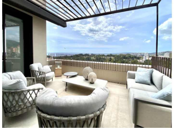
Balcony with sitting area