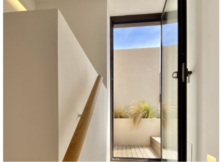
Access to the roof terrace