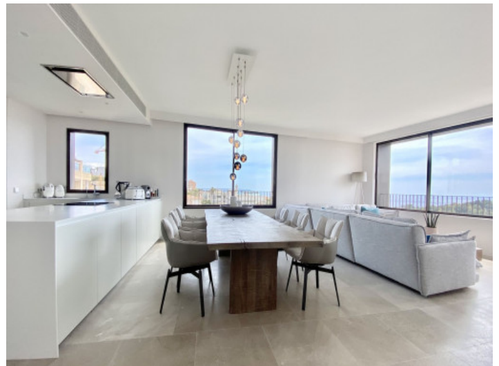
Open living and dining area