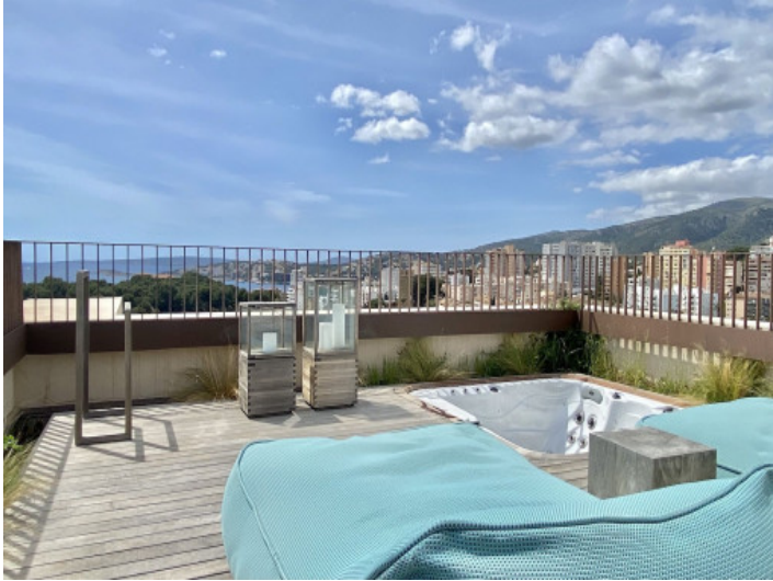
View to the sea