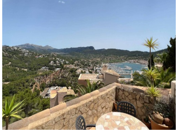
Sea and mountain view