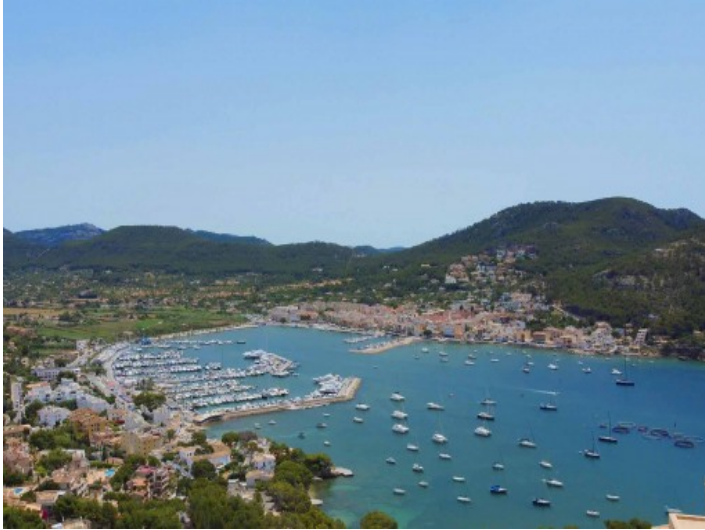
Fantastic view over the bay of Port Andratx