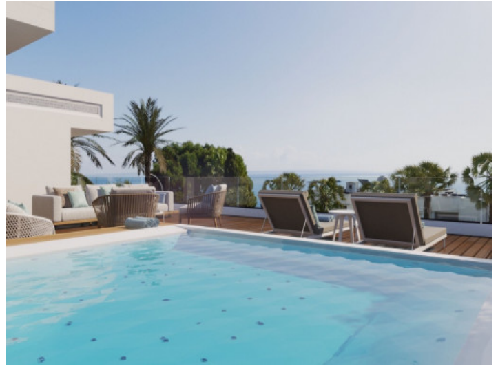
Inviting pool area