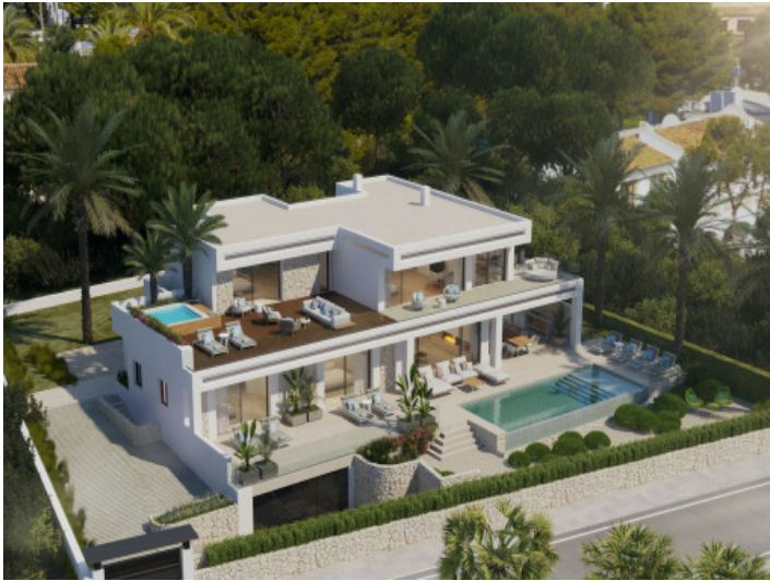
Exterior view of the villa