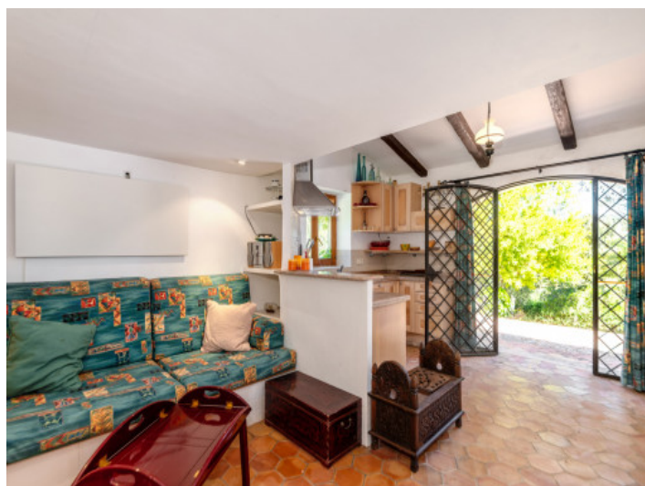
Living area guesthouse