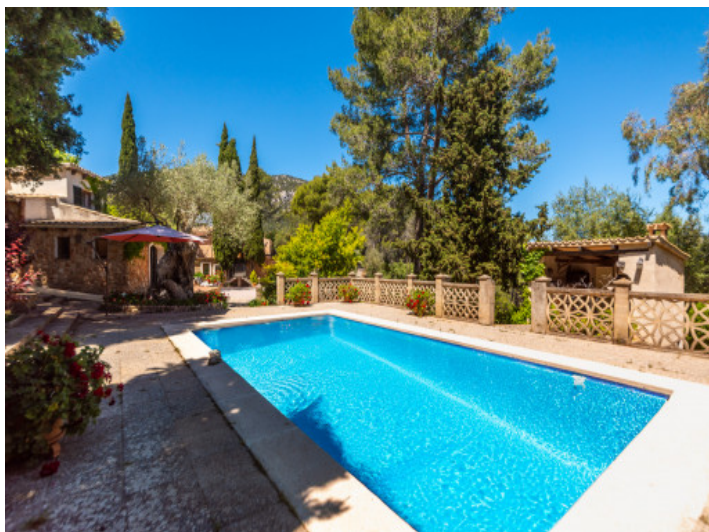
Beautiful pool area