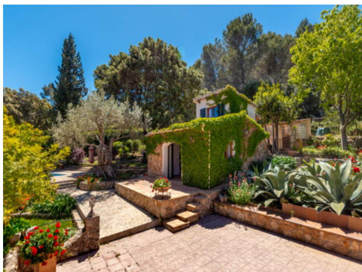
Separate guest house