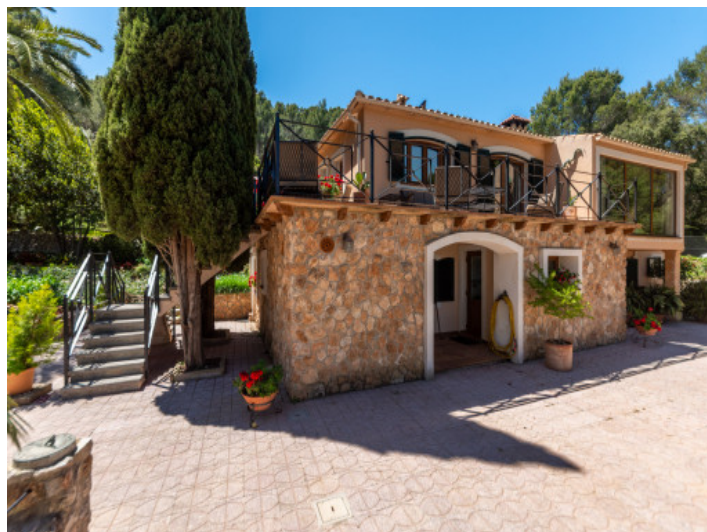
Natural stone walls