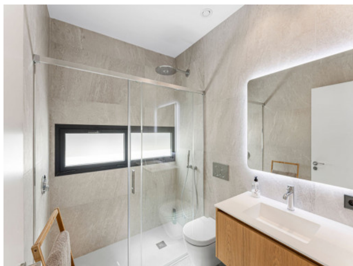
Fully Equipped Bathroom