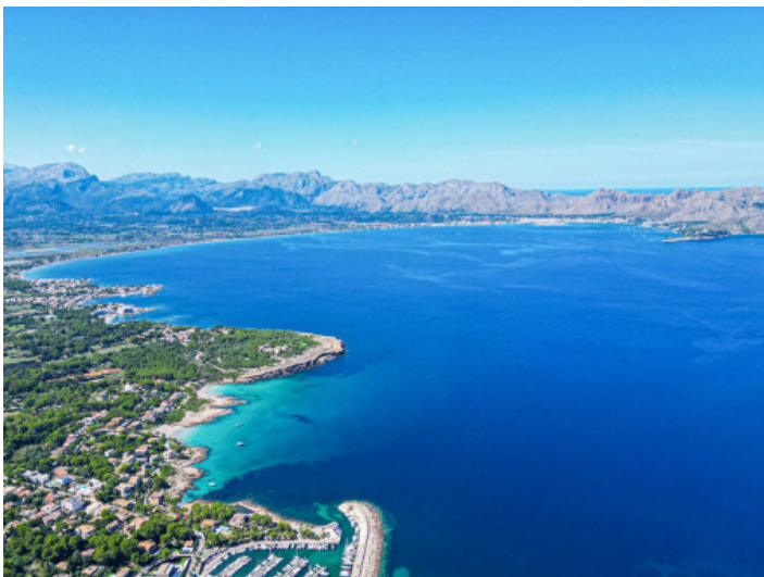
The Sports Marina of Bonaire

All information is correct to the best of our knowledge. Errors and prior sale excepted. This prospectus is purely for information purposes. Only the notarized deed of sale is legally binding.