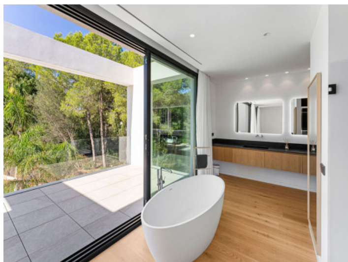
Freestanding Bathtub in the Master Bedroom