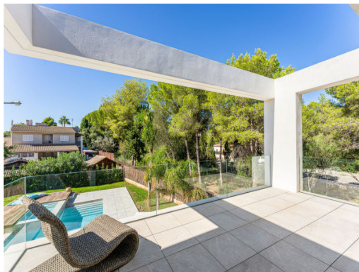
Open Sun Terrace