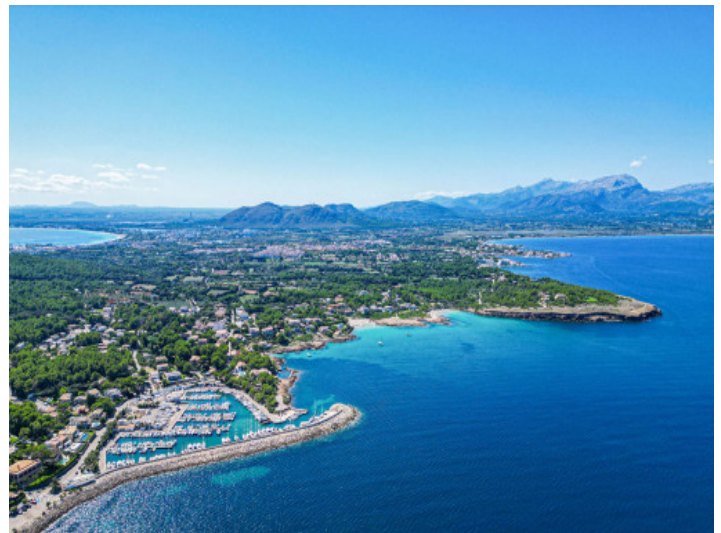
The Bay of Pollens