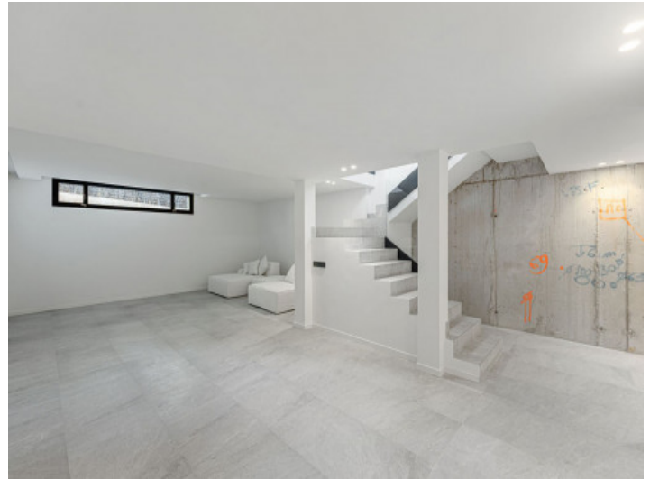
Basement with Versatile Uses