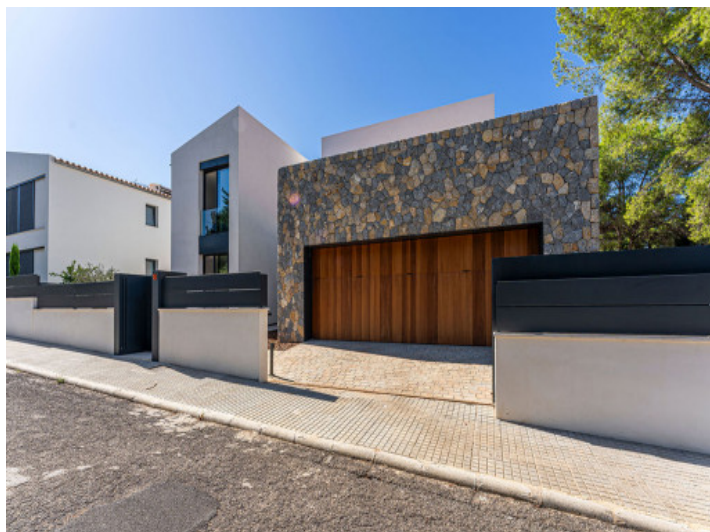
Street View of the Modern Villa