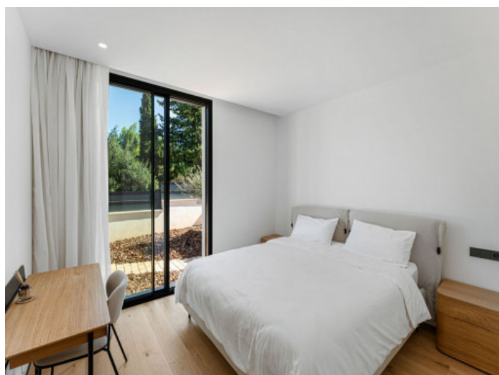
Spacious Double Bedroom

All information is correct to the best of our knowledge. Errors and prior sale excepted. This prospectus is purely for information purposes. Only the notarized deed of sale is legally binding.