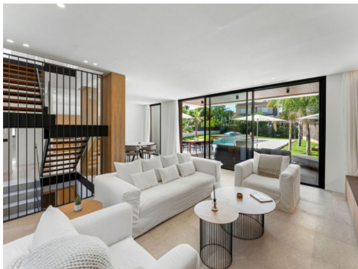
Living-Dining Area with Terrace Access