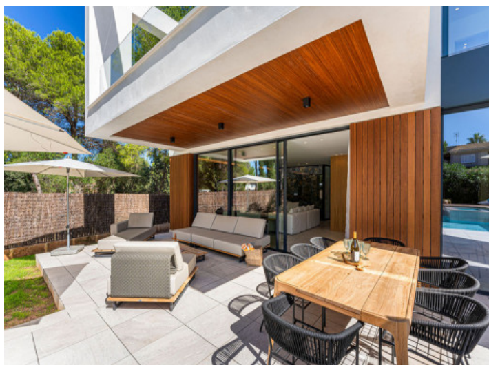
Direct Access from the Living Room to the Terrace