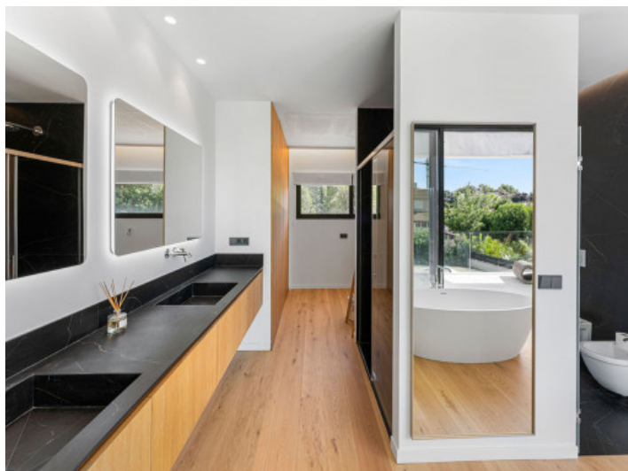
Master Bedroom's Bathroom