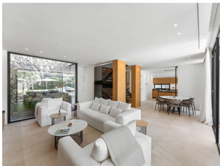
The Stylish Living Area