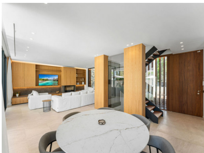
Dining Area and Open Kitchen in the Background