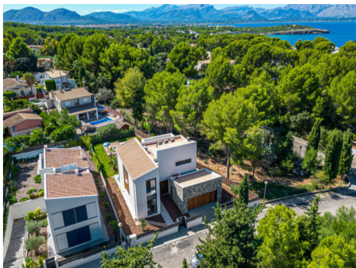
Top Villa Area