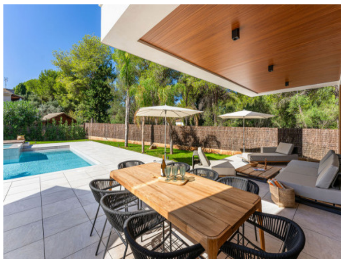
Covered Terrace Overlooking the Pool