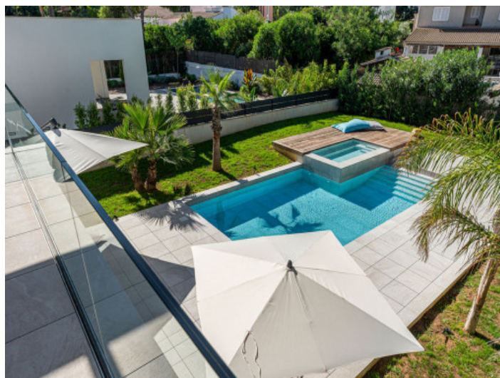
The Pool Nestled in a Well-Maintained Garden

All information is correct to the best of our knowledge. Errors and prior sale excepted. This prospectus is purely for information purposes. Only the notarized deed of sale is legally binding.