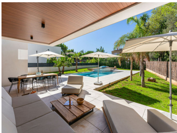
Access from the Terrace to the Garden