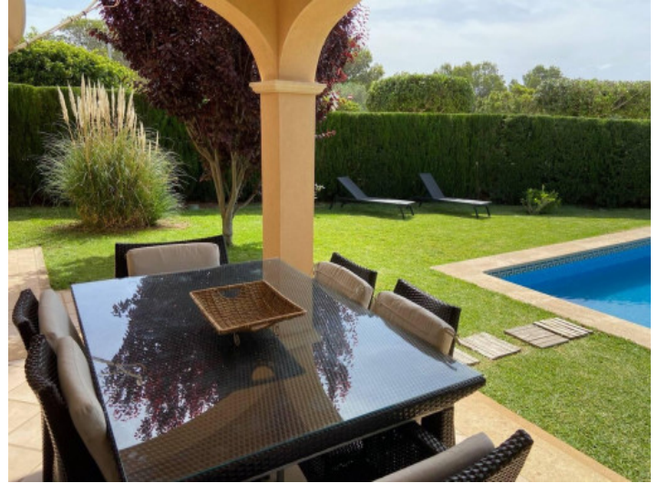
Terrace and pool