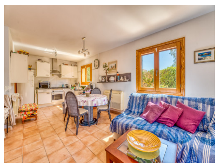
Living area All information is correct to the best of our knowledge. Errors and prior sale excepted. This prospectus is purely for information purposes. Only the notarized deed of sale is legally binding.