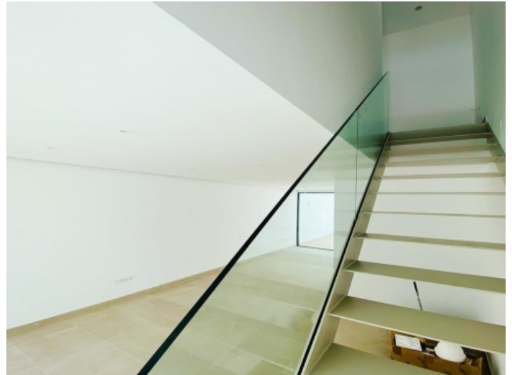
Bright living area and stairs