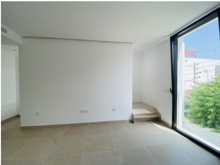
Open room on the first floor