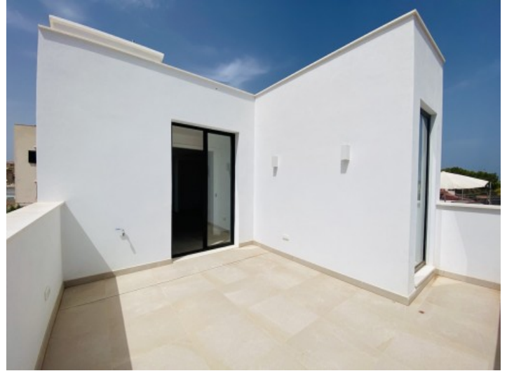
Spacious roof terrace