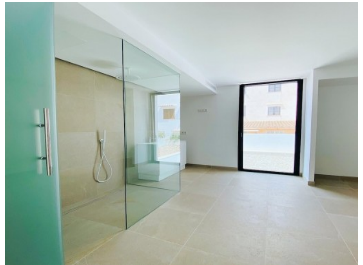
Modern bedroom with bathroom

All information is correct to the best of our knowledge. Errors and prior sale excepted. This prospectus is purely for information purposes. Only the notarized deed of sale is legally binding.