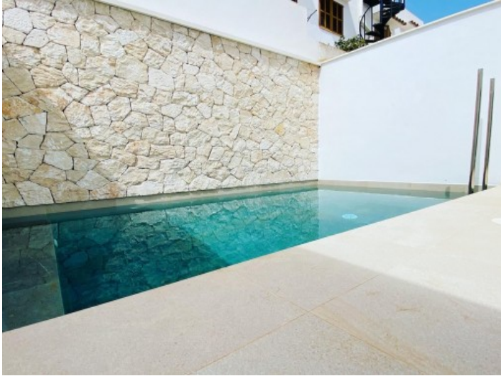
Own pool with sun terrace