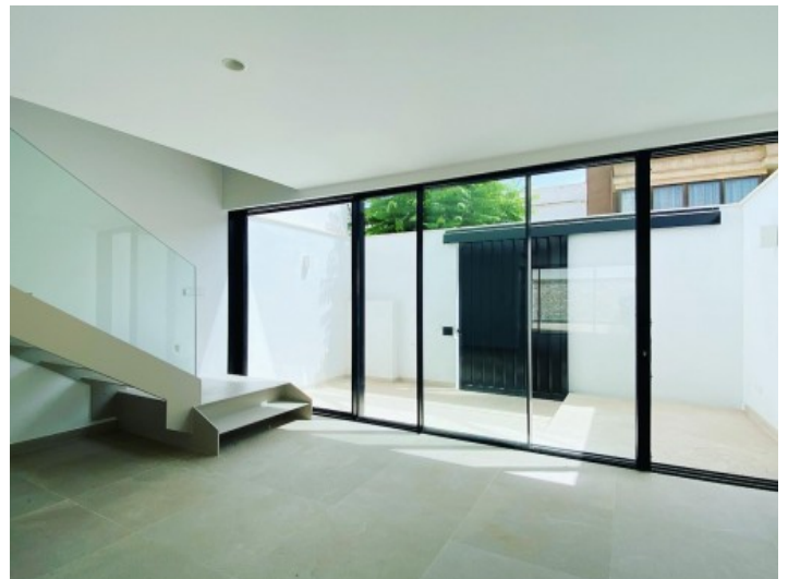
Stylish entrance area

All information is correct to the best of our knowledge. Errors and prior sale excepted. This prospectus is purely for information purposes. Only the notarized deed of sale is legally binding.