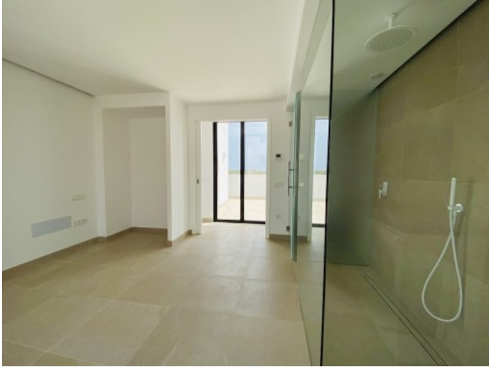
Bedroom/bathroom with roof terrace