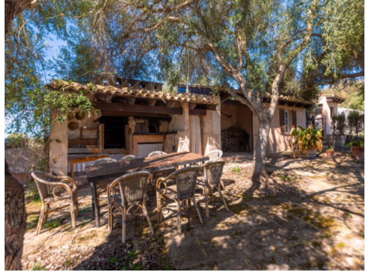
Great BBQ area