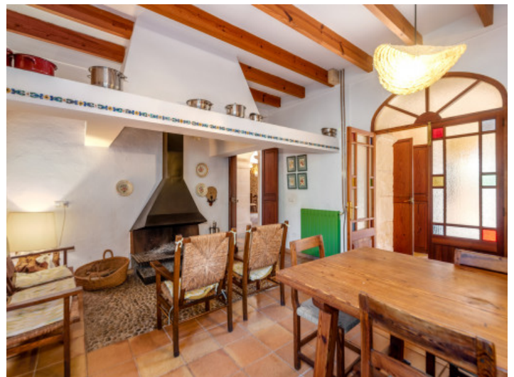
Dining area with fireplace

All information is correct to the best of our knowledge. Errors and prior sale excepted. This prospectus is purely for information purposes. Only the notarized deed of sale is legally binding.