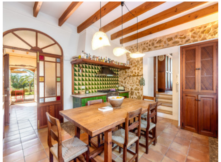
Beautiful countryside kitchen