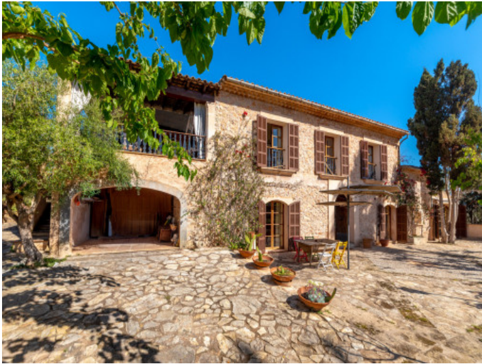
Natural stone facade