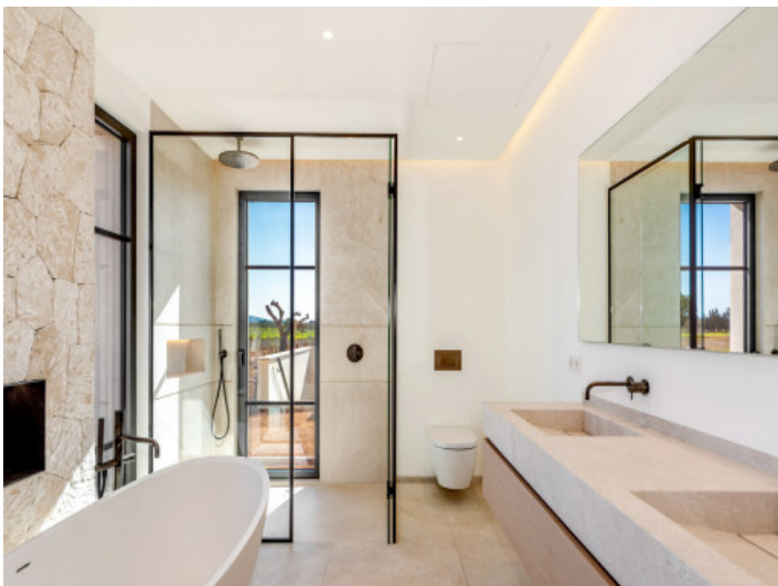
Bathroom en suite