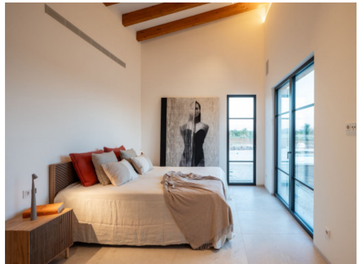
One of 3 comfortable bedrooms