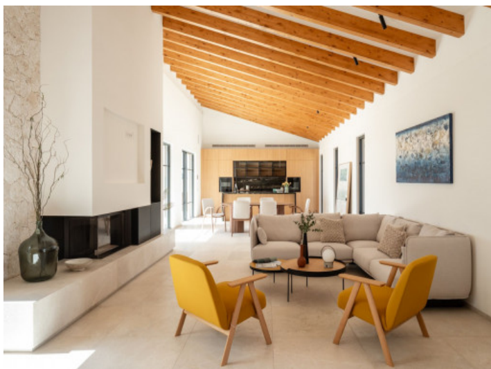
Living area with fireplace