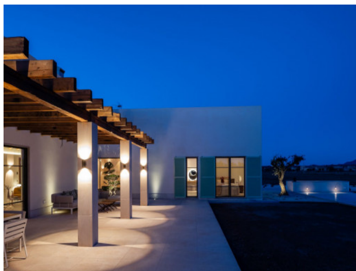
Finca in great location