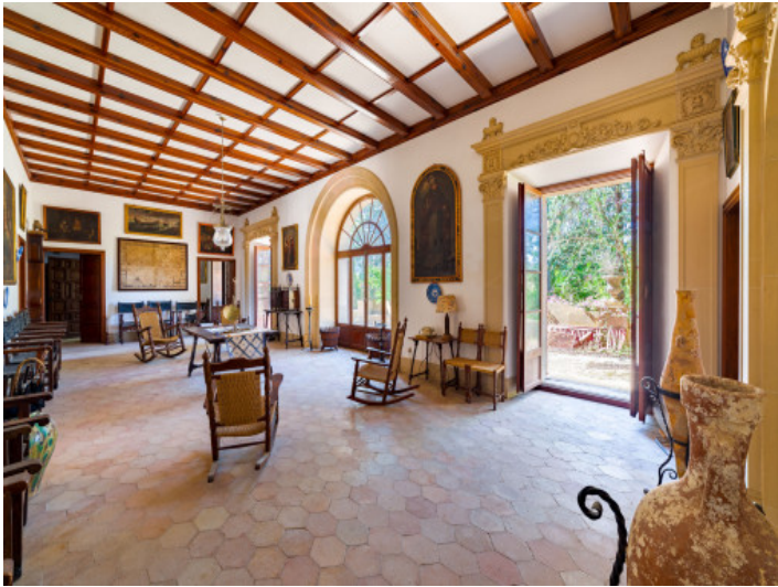
Large property in Establiments