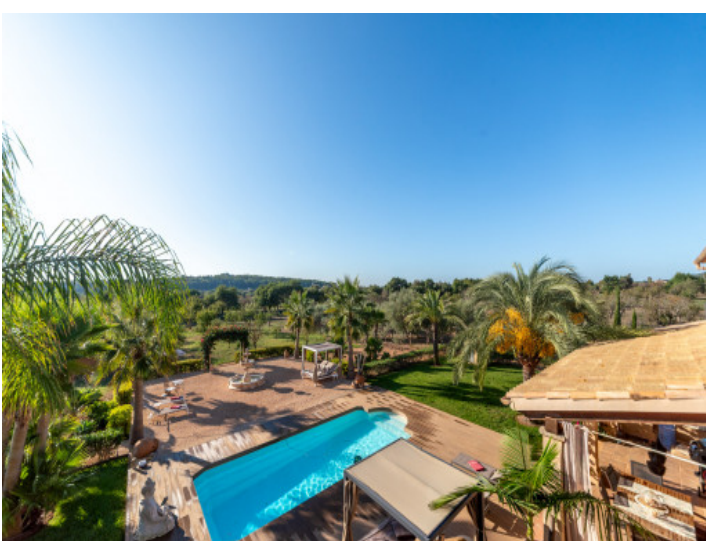
Fantastic sweeping views