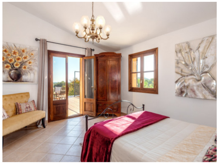
One of 4 bedrooms One of 3 bathrooms All information is correct to the best of our knowledge. Errors and prior sale excepted. This prospectus is purely for information purposes. Only the notarized deed of sale is legally binding.