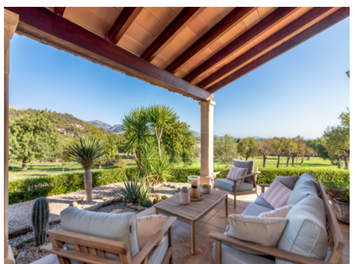
Covered lounge terrace Living area with terrace access All information is correct to the best of our knowledge. Errors and prior sale excepted. This prospectus is purely for information purposes. Only the notarized deed of sale is legally binding.