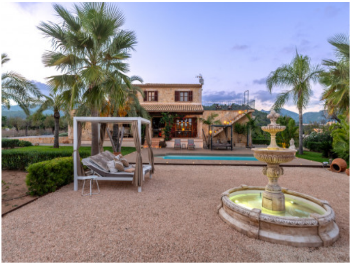
Well-tended pool area