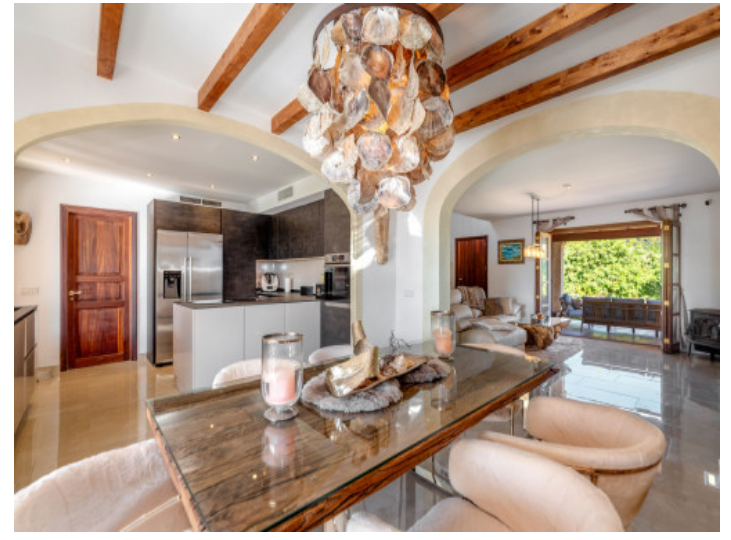
Open dining area