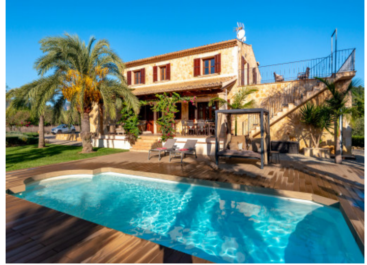
Mediterranean outdoor area