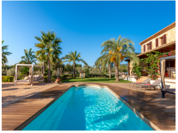
Pool surrounded by terrace