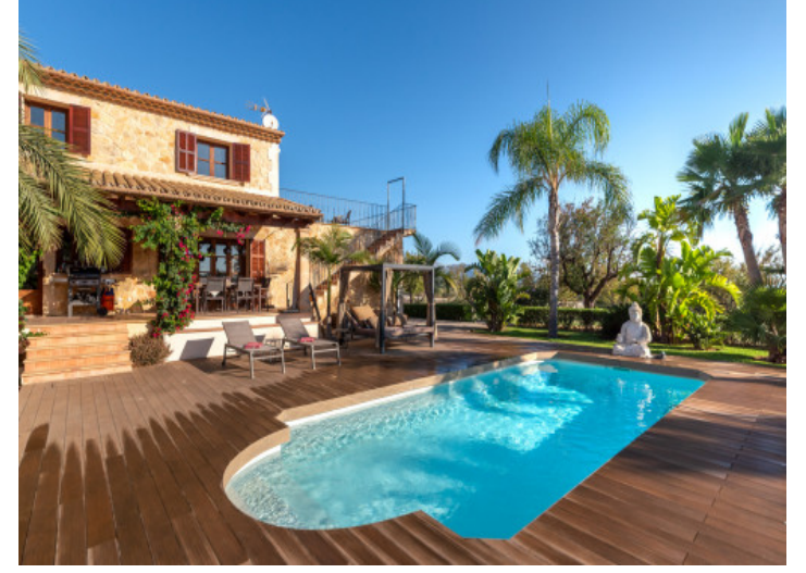
Dreamlike finca with pool

PORTA MALLORQUINA® Your home. Our passion.