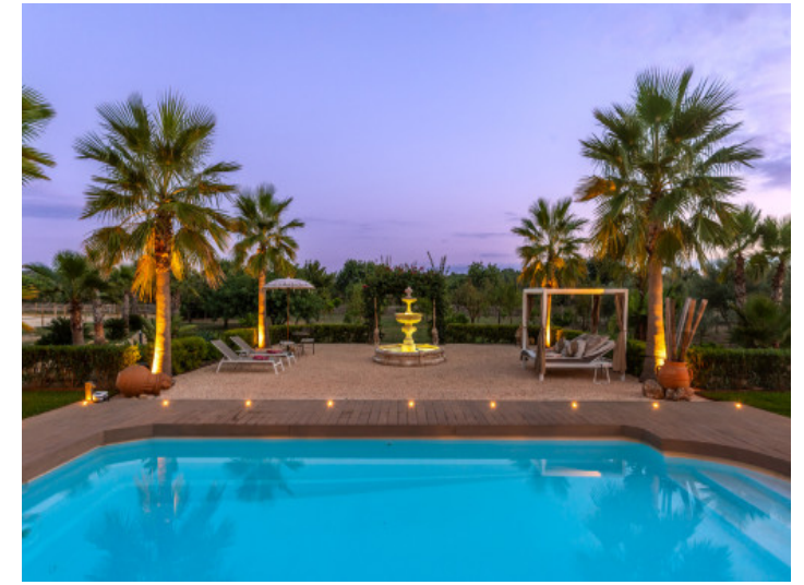
Pool by night