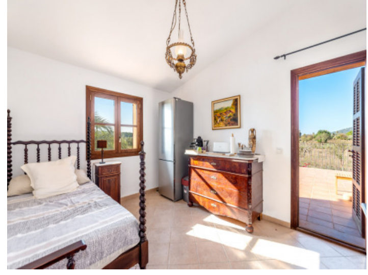
Bedroom with roof terrace access