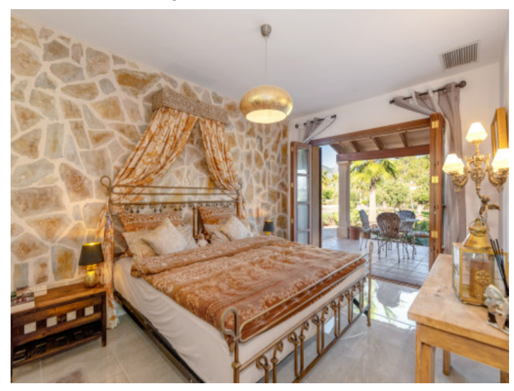
Bedroom with terrace access