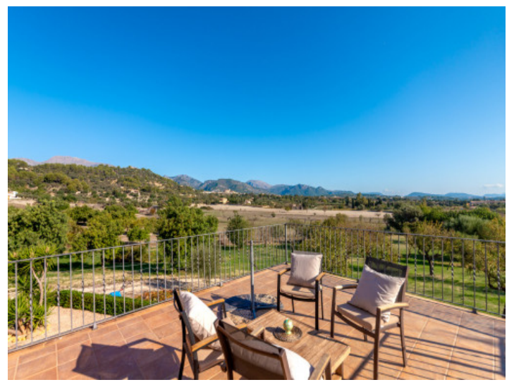
Large roof terrace with sweeping views