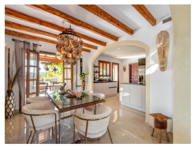
Dining area with access to the outside