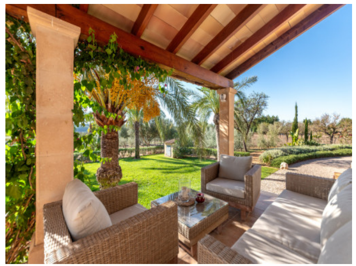
Idyllic terrace Sunny pool area All information is correct to the best of our knowledge. Errors and prior sale excepted. This prospectus is purely for information purposes. Only the notarized deed of sale is legally binding.