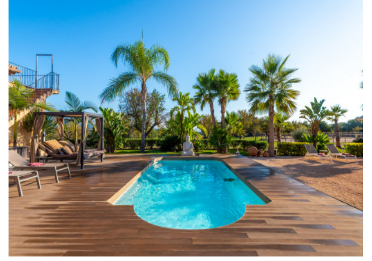
Mediterranean pool area