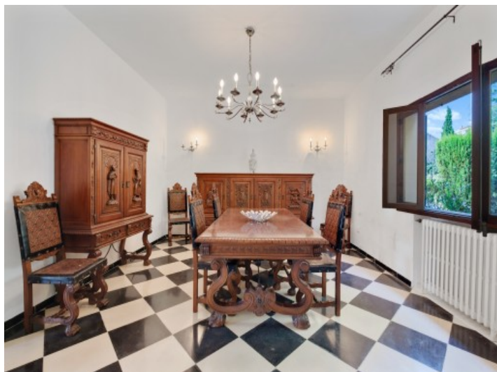
Mallorcan dining area