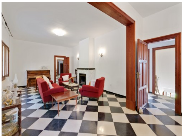
Living area on the upper floor