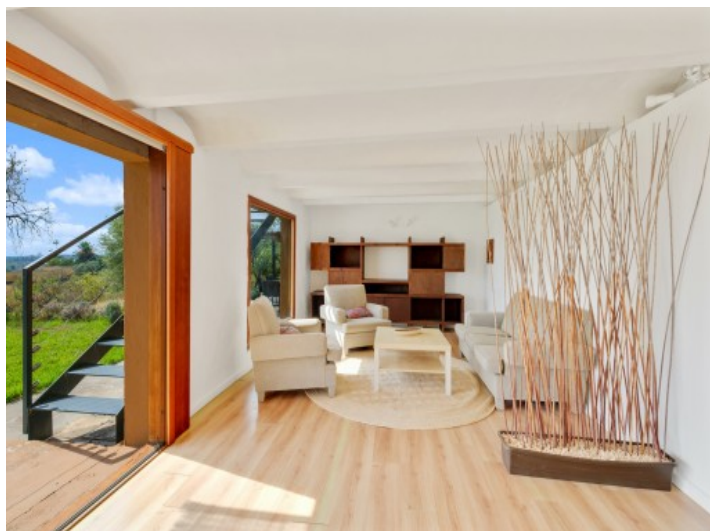
Chill out area on the lower floor