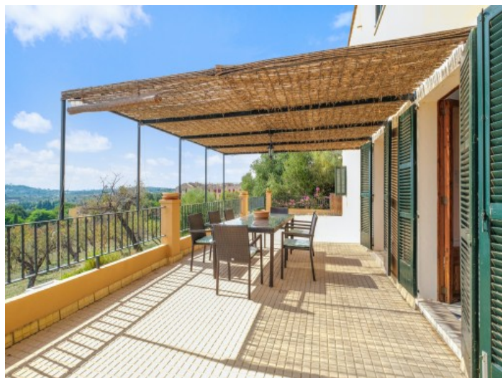
Beautiful covered terrace