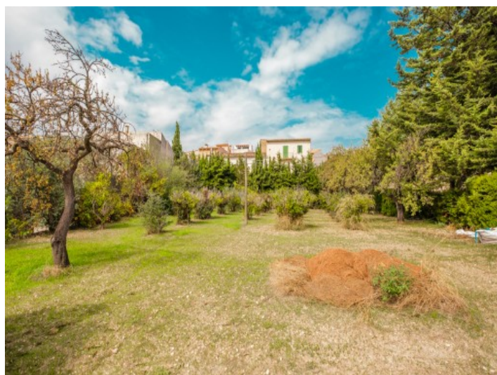
View of the plot