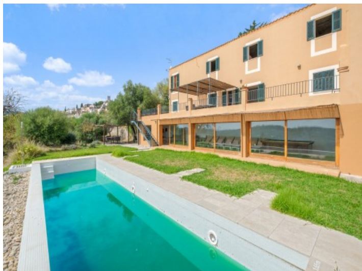
Exterior view and pool