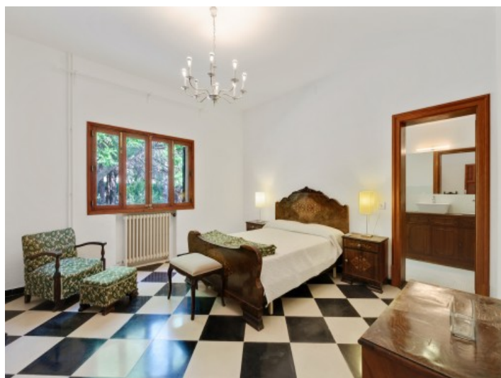
Bedroom with bathroom en suite