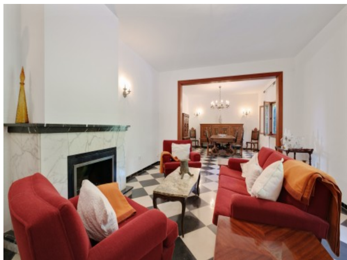
Fire place of the living area

All information is correct to the best of our knowledge. Errors and prior sale excepted. This prospectus is purely for information purposes. Only the notarized deed of sale is legally binding.