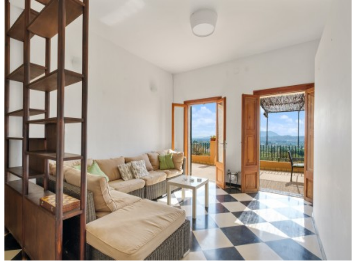
Separate living area with terrace access