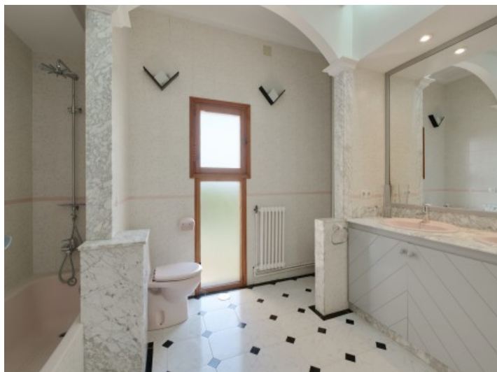
One of 3 bathrooms