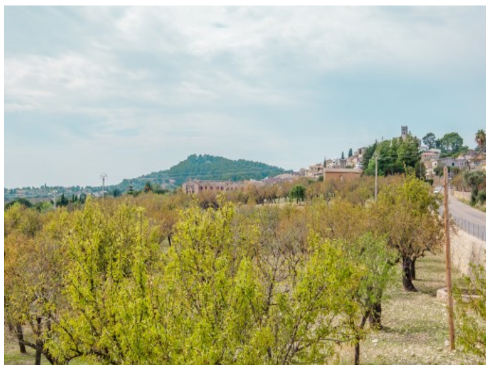
View of the surroundings

All information is correct to the best of our knowledge. Errors and prior sale excepted. This prospectus is purely for information purposes. Only the notarized deed of sale is legally binding.