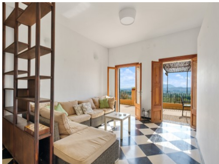
Separate living area with terrace access