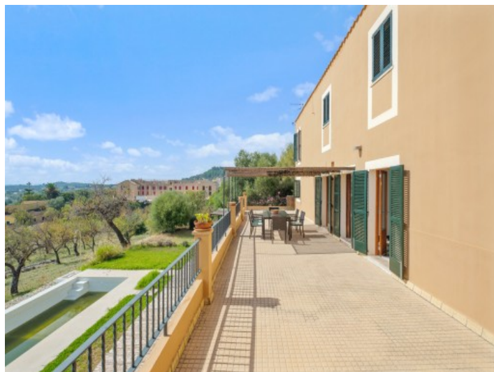
Large terrace with garden views