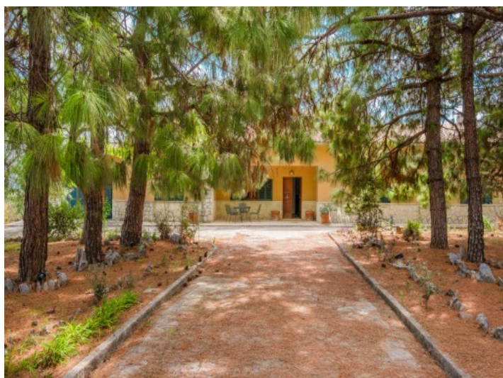
Green, idyllic surroundings