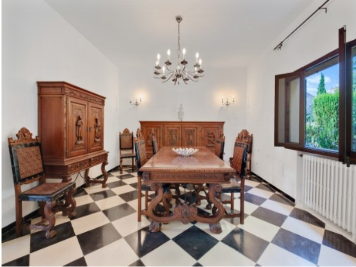
Mallorcan dining area