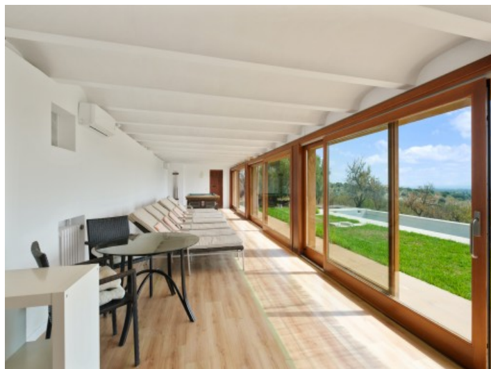
Spa area with a view