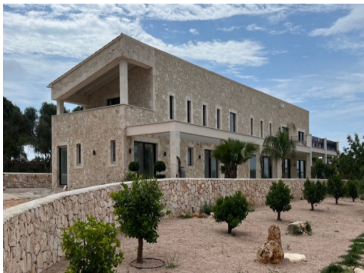
Mallorquin finca and garden