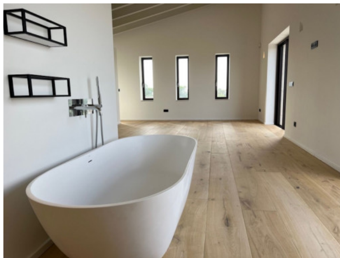
Open bathroom and bedroom