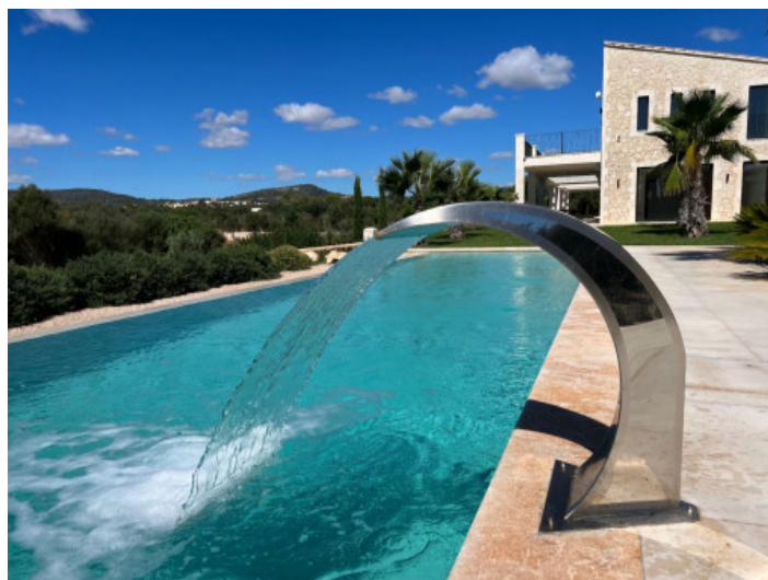
Fantastic pool area

All information is correct to the best of our knowledge. Errors and prior sale excepted. This prospectus is purely for information purposes. Only the notarized deed of sale is legally binding.