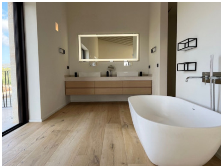
Bathroom with bathtub and daylight