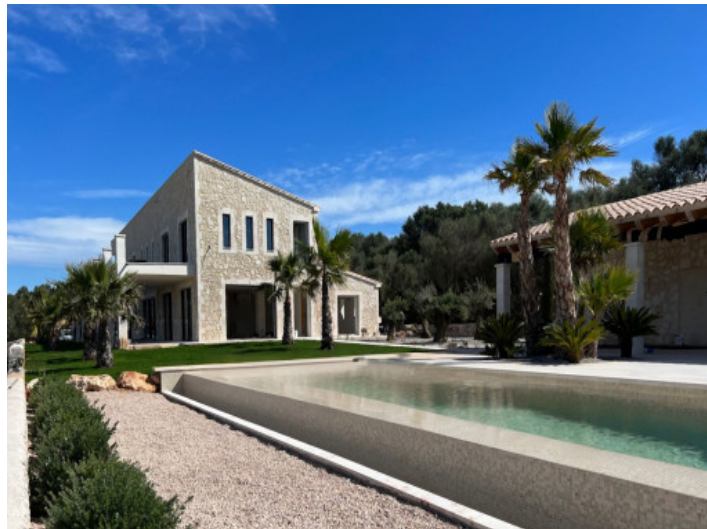
Views from the pool to the finca