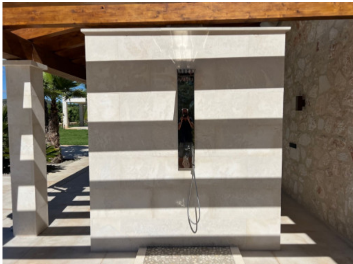
Outdoor shower from the pool area