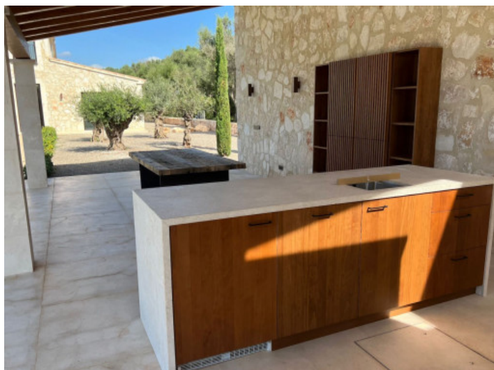
Covered terrace with summer kitchen