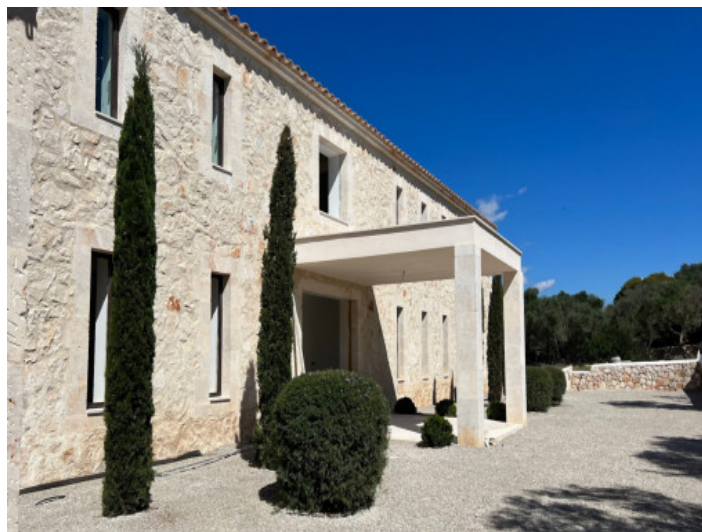
Finca with natural stone front