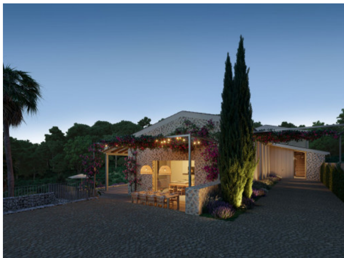
Finca by night

All information is correct to the best of our knowledge. Errors and prior sale excepted. This prospectus is purely for information purposes. Only the notarized deed of sale is legally binding.