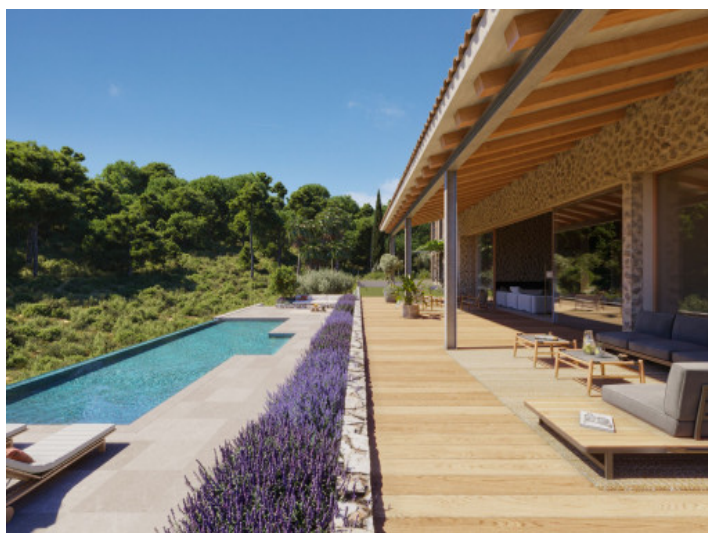
Paradisiacal terrace and pool area