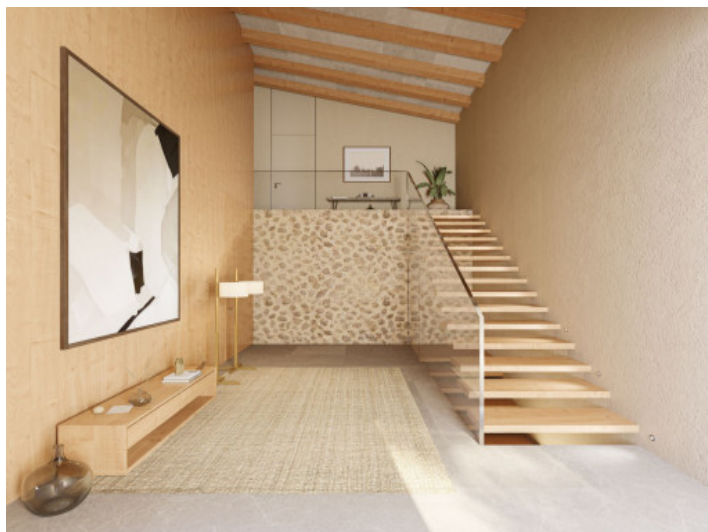
Elegant interior design