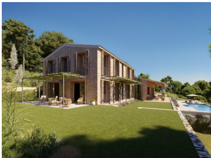
Wonderfully laid-out garden