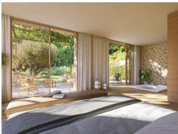
Direct access to the outside