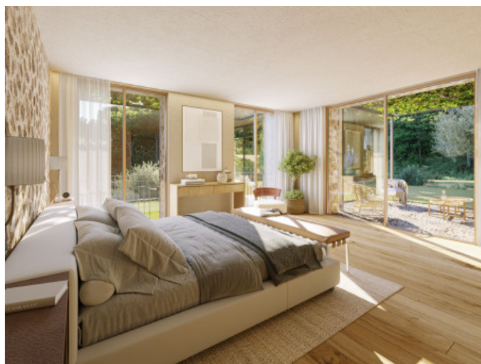
Luxurious master bedroom