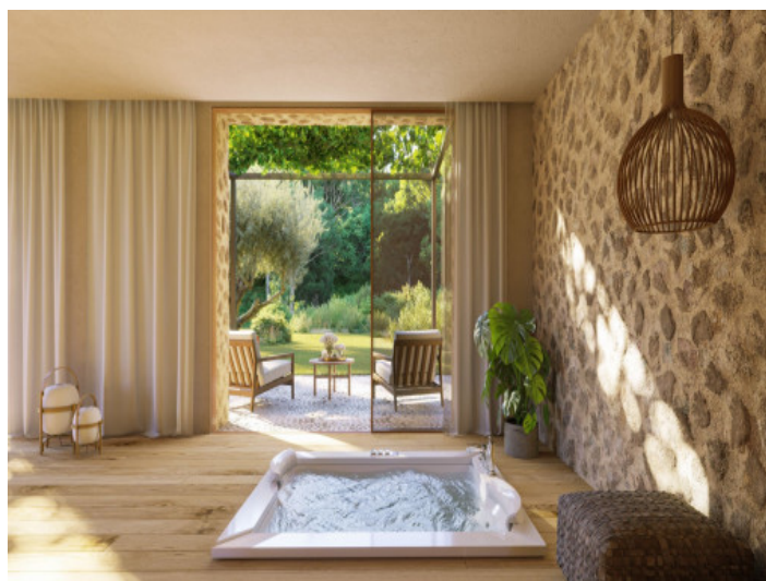
Jacuzzi in the bedroom