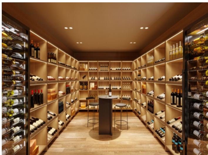
Fantastic own bodega