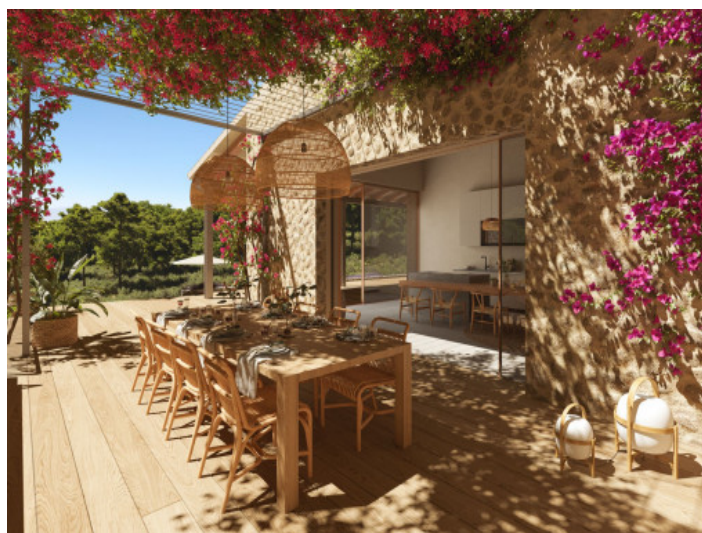
Idyllic outdoor dining area