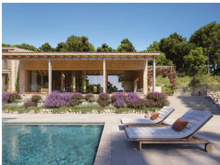
Mediterranean pool oasis