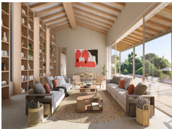
Lightfilled living area with high ceiling