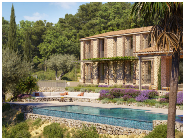
Exterior view of the finca