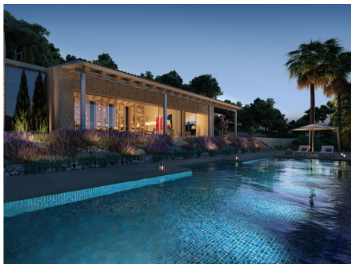
Finca and pool by night

All information is correct to the best of our knowledge. Errors and prior sale excepted. This prospectus is purely for information purposes. Only the notarized deed of sale is legally binding.