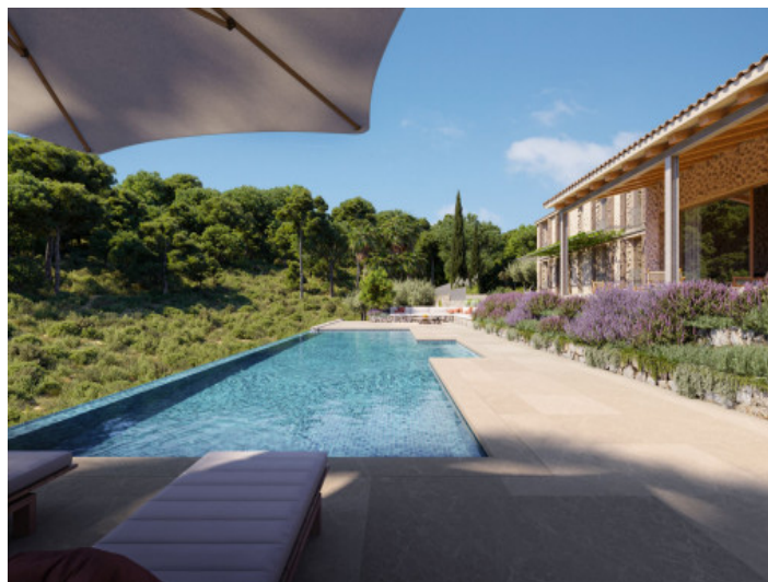
Pool area that offers absolute privacy