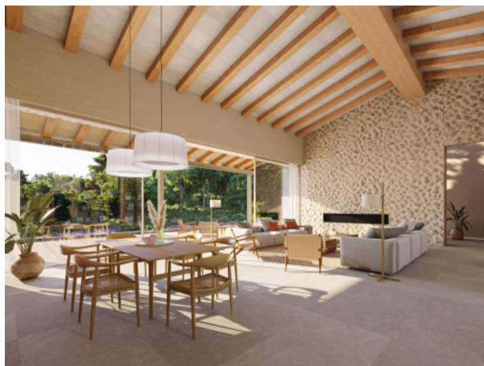
Open plan living and dining area

All information is correct to the best of our knowledge. Errors and prior sale excepted. This prospectus is purely for information purposes. Only the notarized deed of sale is legally binding.