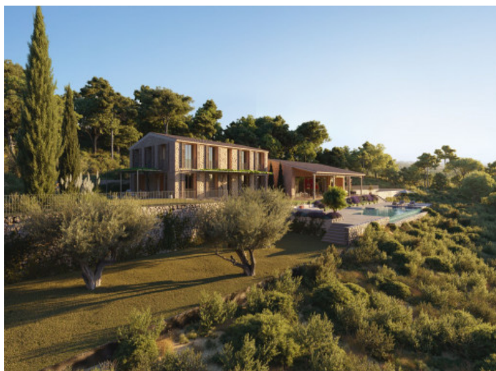
Situated in a tranquil location