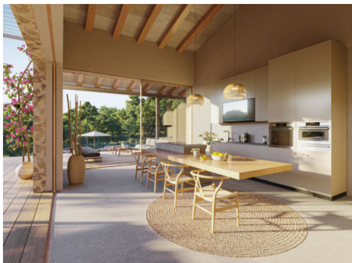
Fluent access to the open kitchen