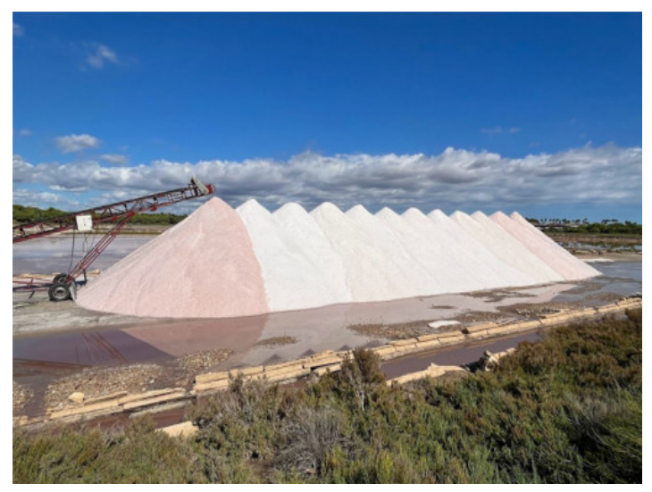
Es Trenc salt marshes