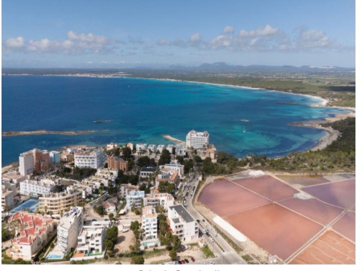
Colonia Sant Jordi

All information is correct to the best of our knowledge. Errors and prior sale excepted. This prospectus is purely for information purposes. Only the notarized deed of sale is legally binding.