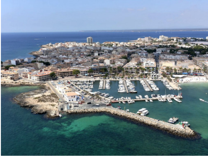
Harbour of Colonia Sant Jordi