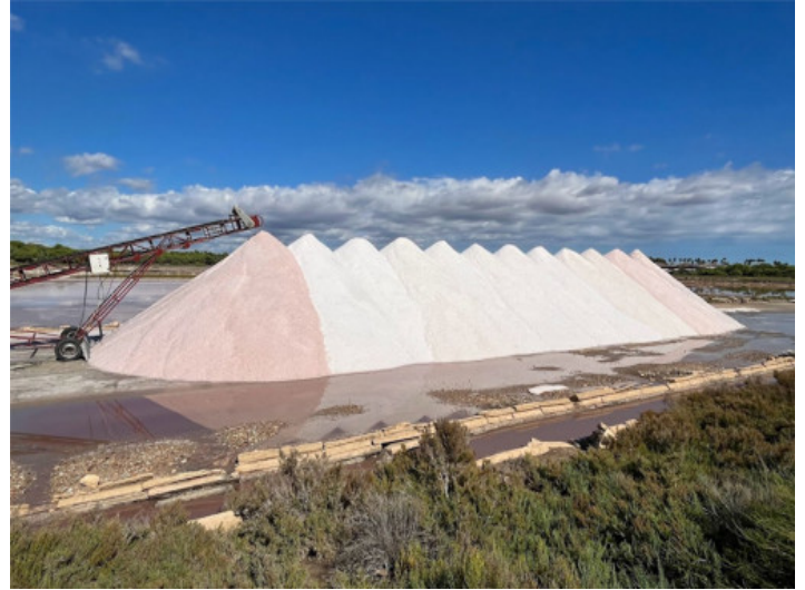
Es Trenc salt marshes