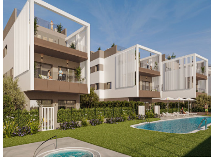
Facade and Community pool