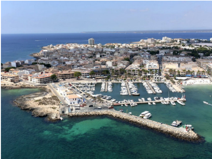
Harbour of Colonia Sant Jordi