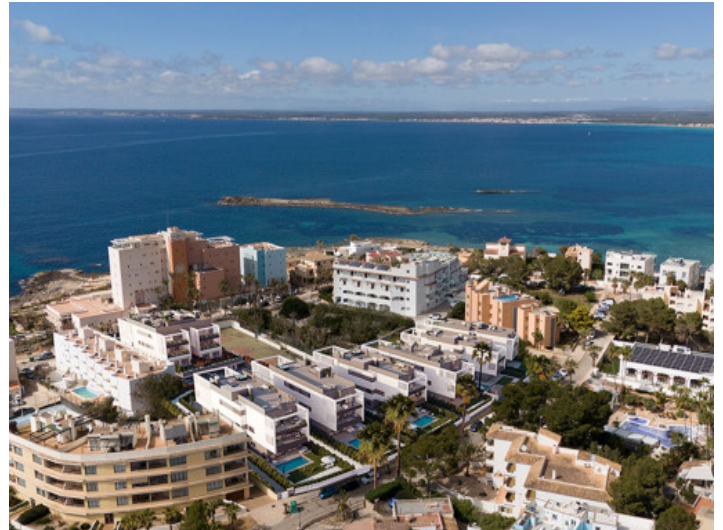
Nice village in the southeast